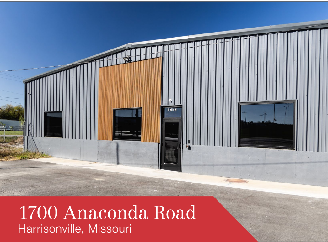
1700 Anaconda Road Harrisonville, Missouri