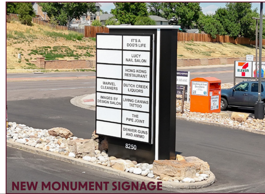
NEW MONUMENT SIGNAGE