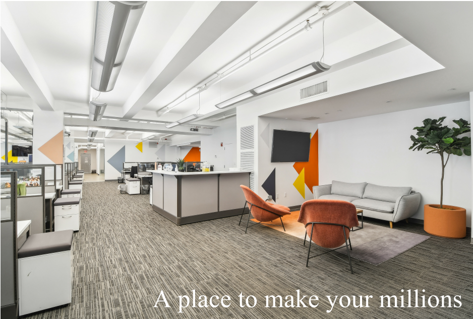
A place to make your millions