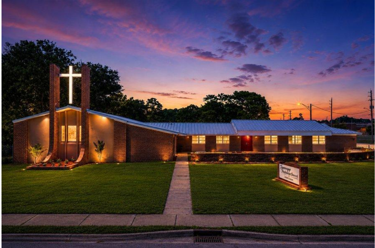
Exterior — Twilight View

8075 Lone Star Road, Jacksonville, FL 32211