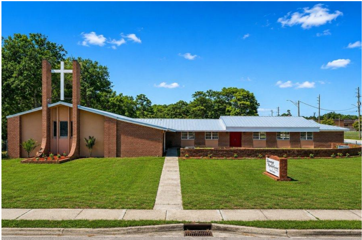
Exterior — Daytime View