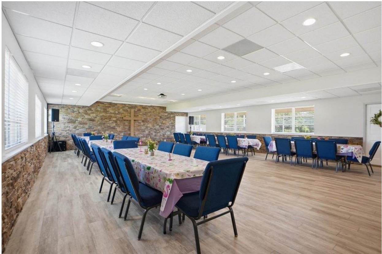
Fellowship Hall / Dining Room