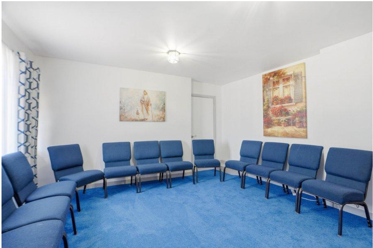
Meeting Room / Small Group Space