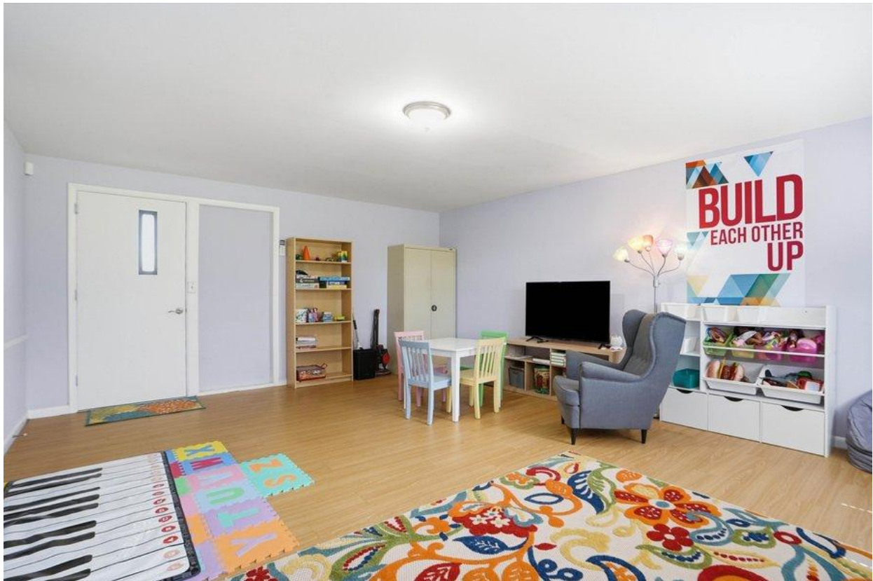
Children's Ministry Room