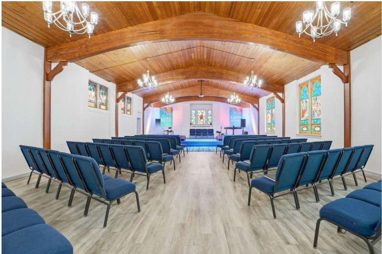
Sanctuary — Cathedral Ceiling & Stage