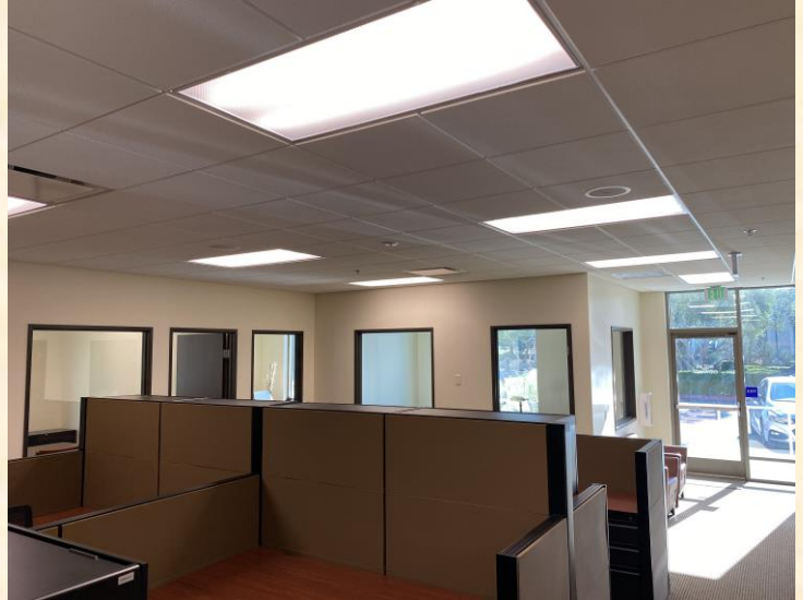
INTERIOR - PRIVATE OFFICES & OPEN AREA WITH CUBICLE DESKS