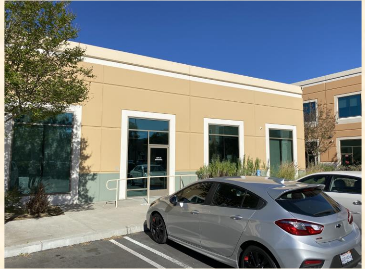
PRIVATE ENTRY - EXTERIOR VIEW