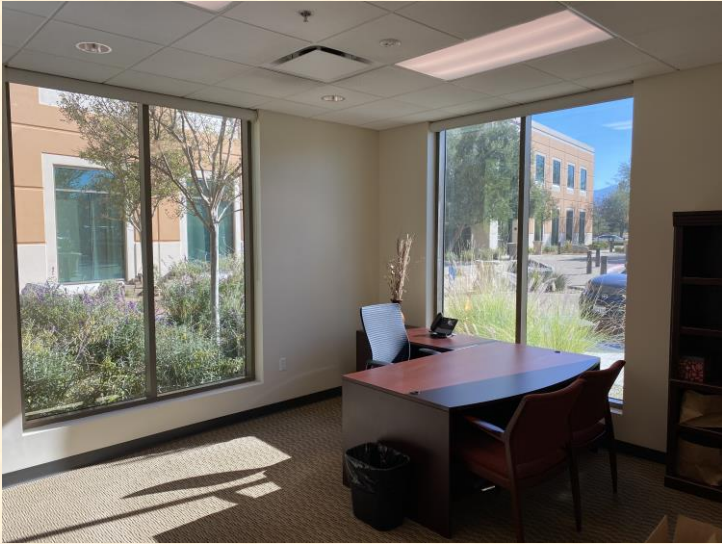
PRIVATE OFFICE - TYPICAL

368 E VANDERBILT WAY, SAN BERNARDINO, CA