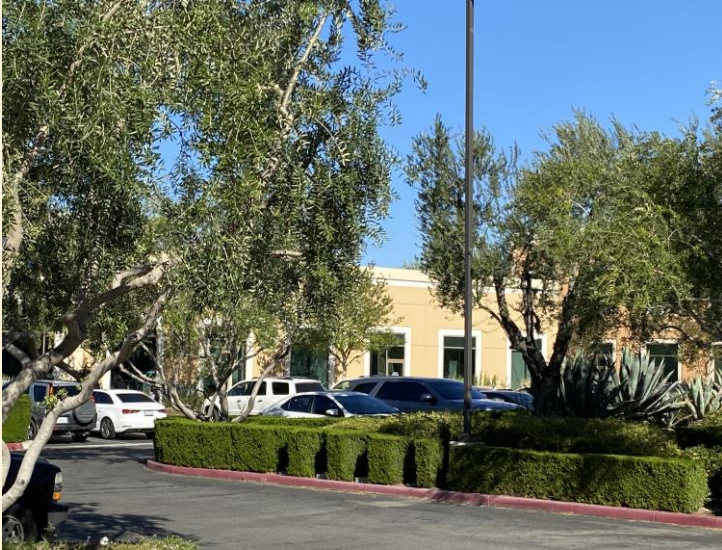
PARKING AREA WITH BUILDING EXTERIOR IN VIEW