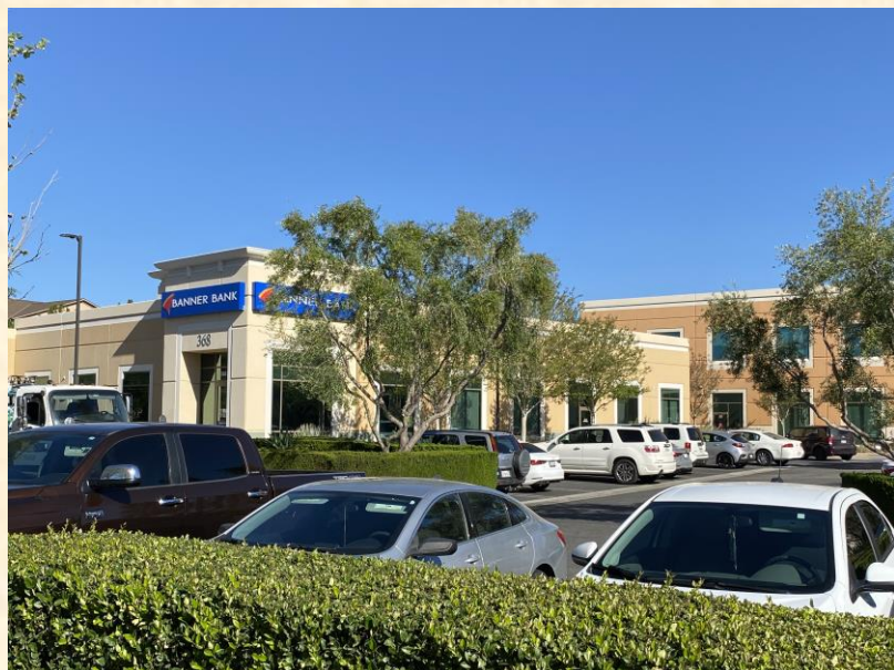
BUILDING VIEW WITH PARKING AREA INCLUDED