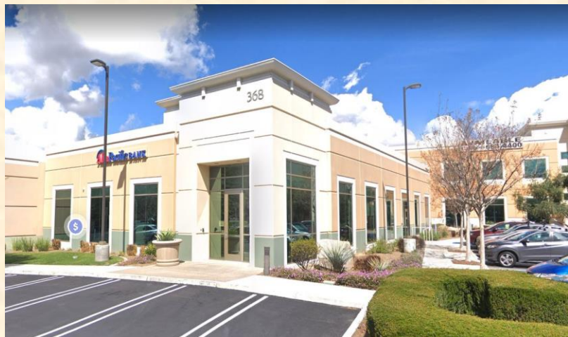
368 E VANDERBILT WAY – BUILDING VIEW WITH SUITE ENTRY IN REAR

368 E VANDERBILT WAY, SAN BERNARDINO, CA