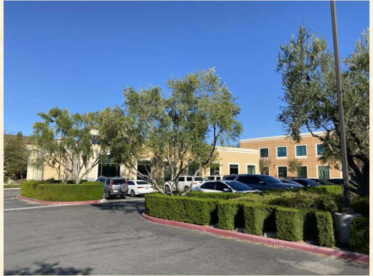
PARKING AREA WITH SUITE ENTRY IN VIEW