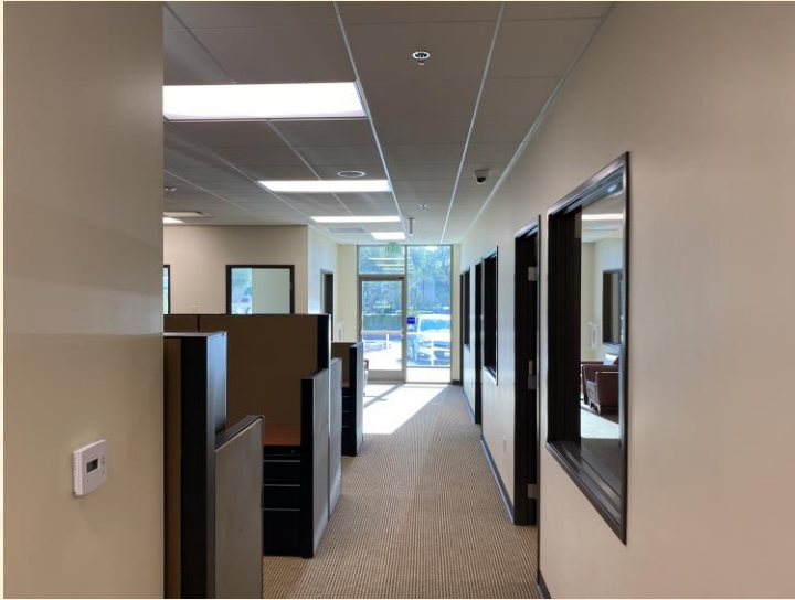
INTERIOR – OPEN AREA & OFFICES WITH SEPARATE ENTRY IN VIEW

368 E VANDERBILT WAY, SAN BERNARDINO, CA