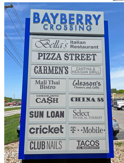
MONUMENT SIGNAGE AVAILABLE