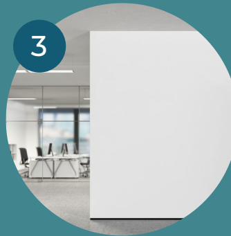
Dunn Edwards Cool December Paint