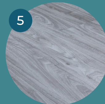
Modern Surface Essential Luxury Vinyl Plank