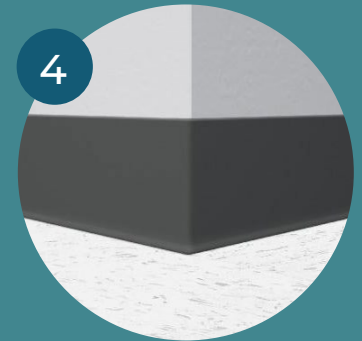
Johnsonite 4" Charcoal Rubber Base