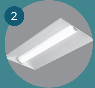
LED Light Fixtures