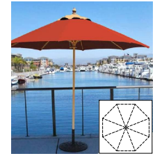
2 PATIO UMBRELLA SCALE: NTS

Digitally signed by Frederick J Goglia DN: CN = Frederick J Goglia, C = US, O = IdentTrust ACES Unaffiliated Individual Date: 2016.07.21 14:28:03 -05'00'