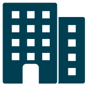
Flex office space