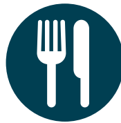
Close to numerous restaurants, shops, etc.