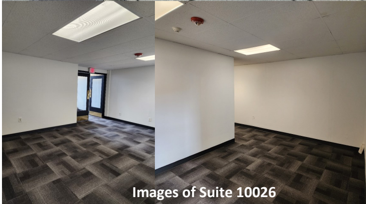
Images of Suite 10026