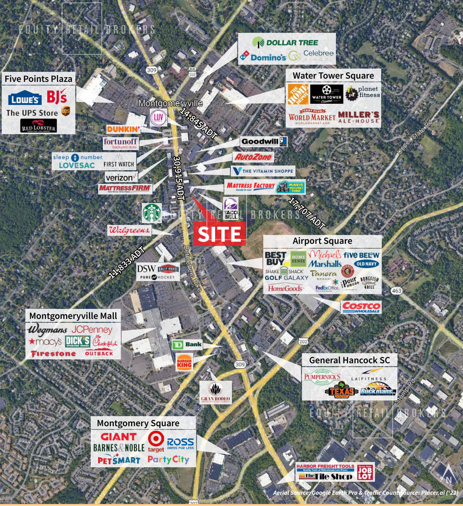
Aerial Source: Google Earth Pro & Traffic Count Source: Placer.ai ('22)