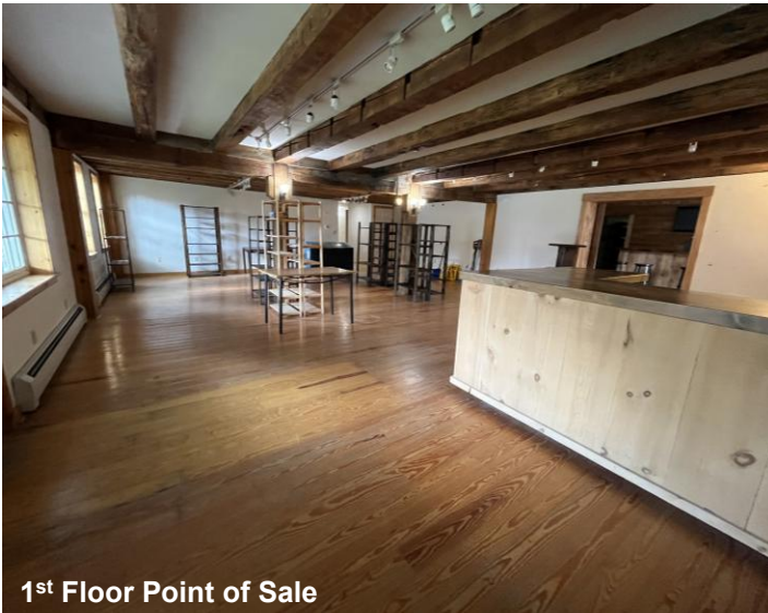
1st Floor Point of Sale