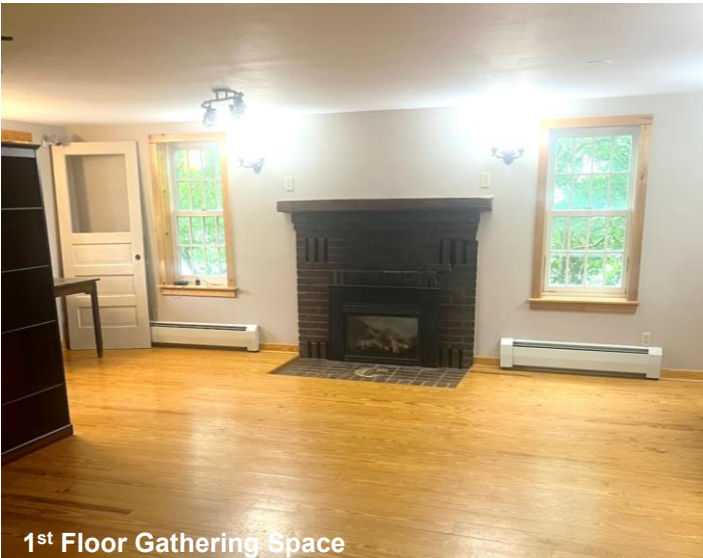
1st Floor Gathering Space