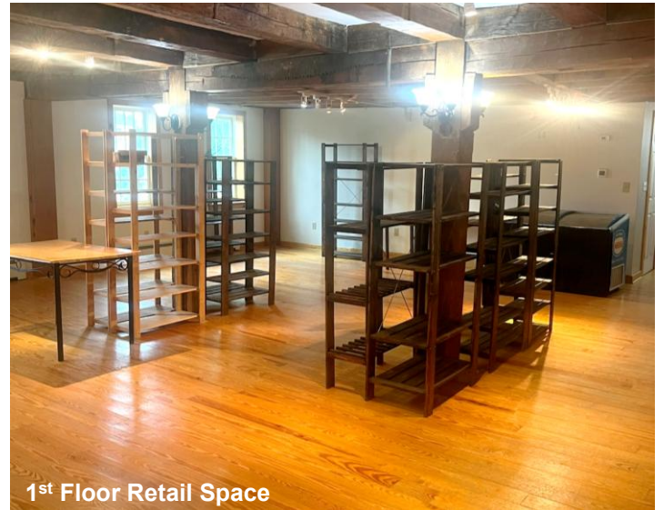
1st Floor Retail Space