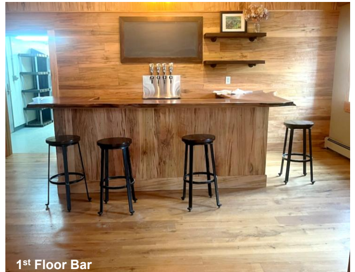
1st Floor Bar