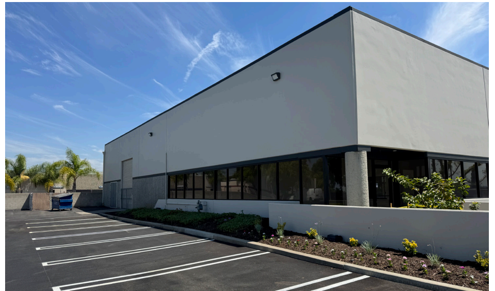
North Side Parking