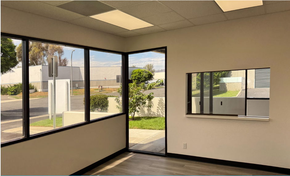
New Office Finishes