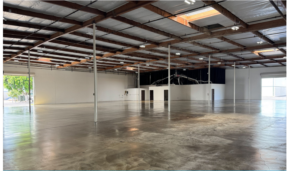
Fully Renovated Warehouse