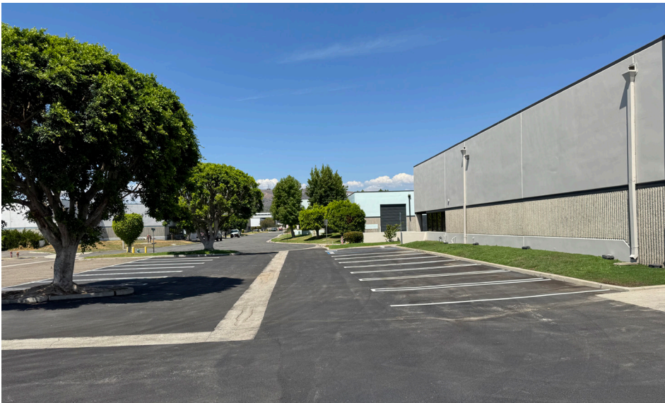
West Side Parking