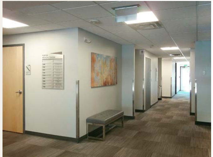
ALL photography, all pages | Copyright © 2019 by J. Barry Winter | All Rights Reserved