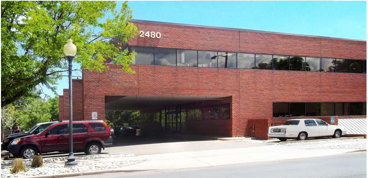
ALL photography, all pages | Copyright © 2019 by J. Barry Winter | All Rights Reserved