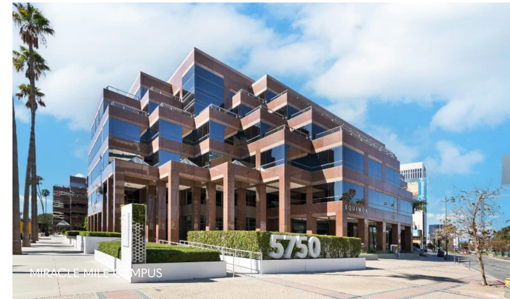
MIRACLE MILE CAMPUS