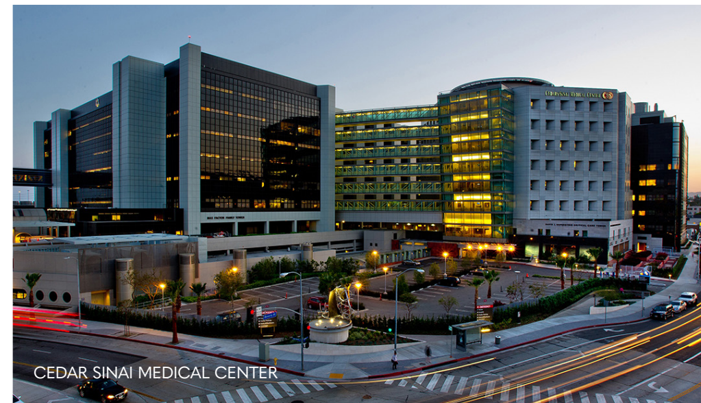
CEDAR SINAI MEDICAL CENTER