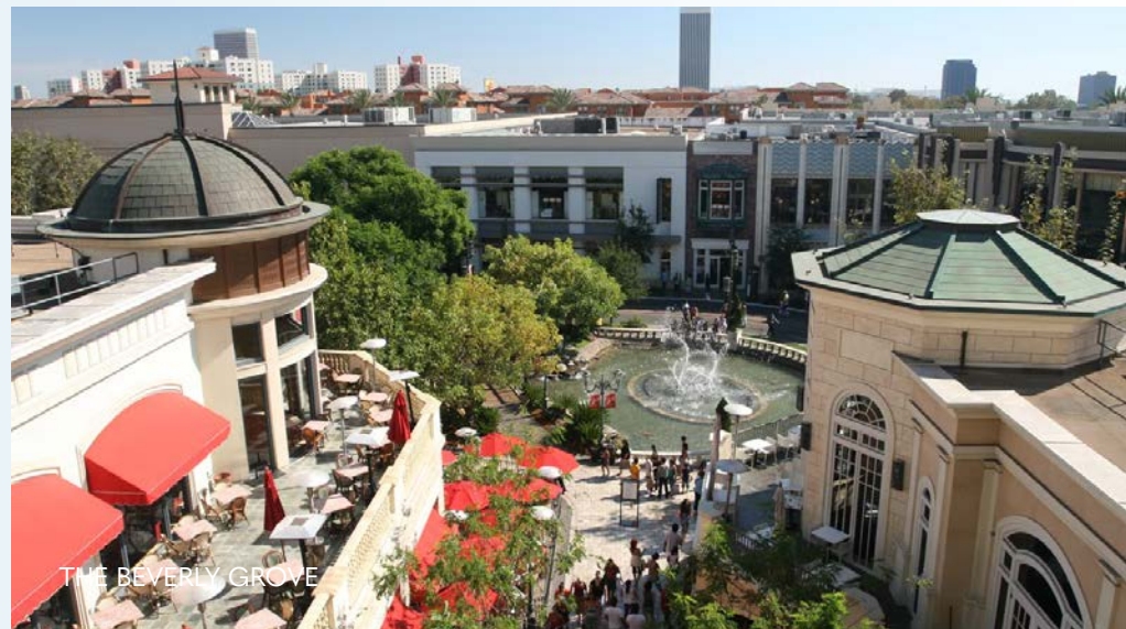
THE BEVERLY GROVE

5613 San Vicente Boulevard is located within the Miracle Mile submarket of Los Angeles, one of the city's most recognized and institutionally supported urban corridors. Miracle Mile functions as both a cultural destination and a dense mixed-use district, anchored along Wilshire Boulevard and supported by a combination of world-class museums, retail corridors, employment centers, and affluent residential neighborhoods.