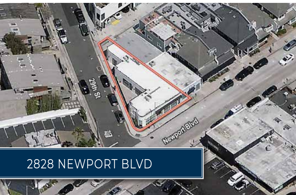
2828 NEWPORT BLVD