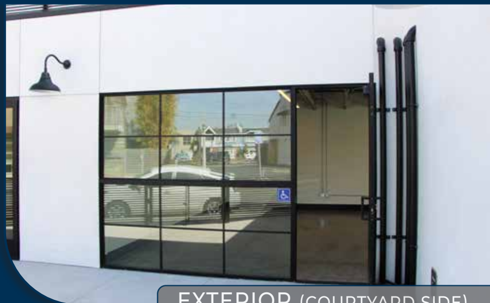
EXTERIOR (COURTYARD SIDE)