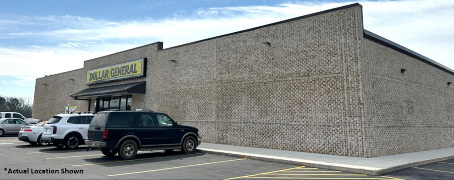
*Actual Location Shown