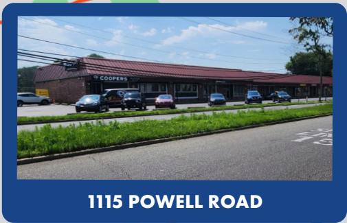
1115 POWELL ROAD