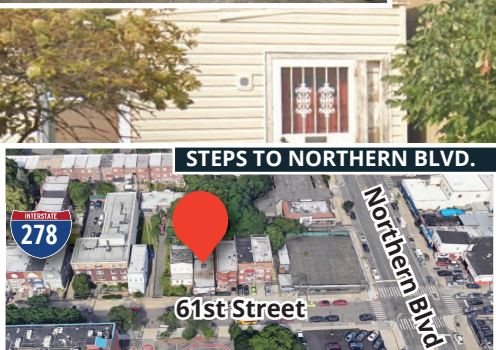
STEPS TO NORTHERN BLVD.