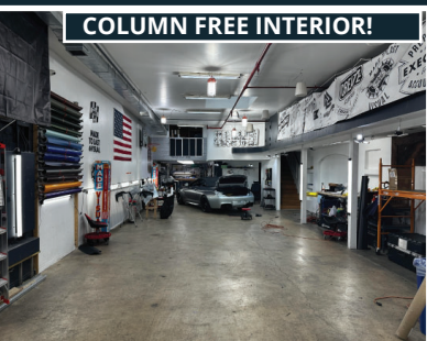
COLUMN FREE INTERIOR!