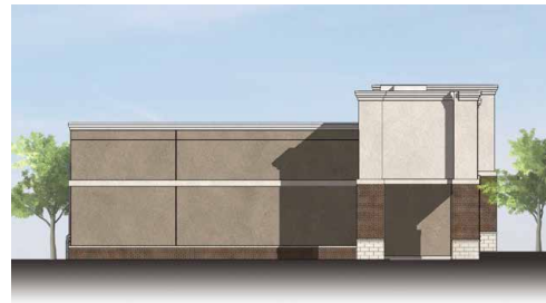
Building C | East Elevation