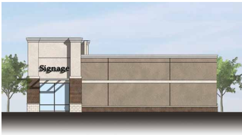
Building C | West Elevation