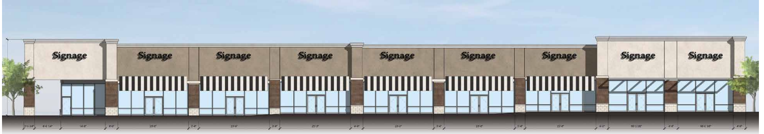
Building C | North Elevation