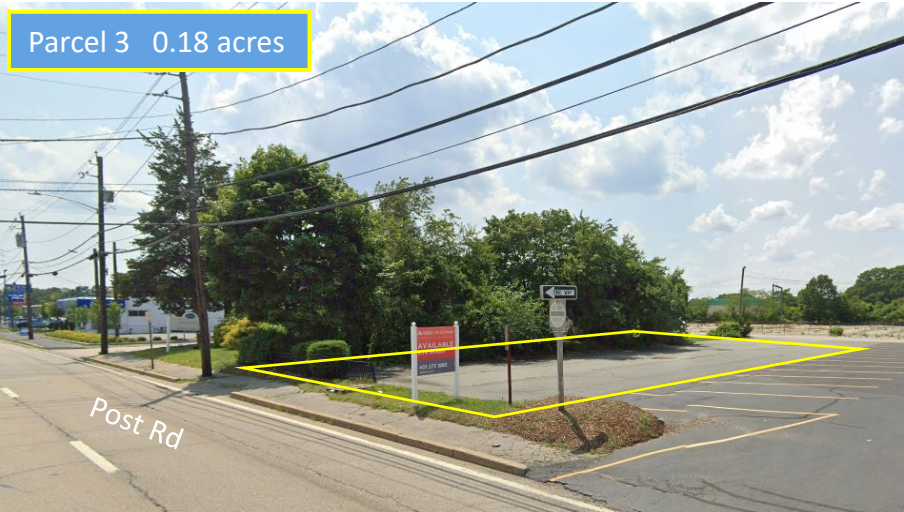
Parcel 3 0.18 acres