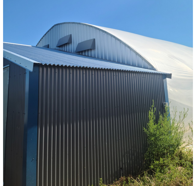
713 Mayor Patricia Reigel Blvd., Moffat, CO 81143