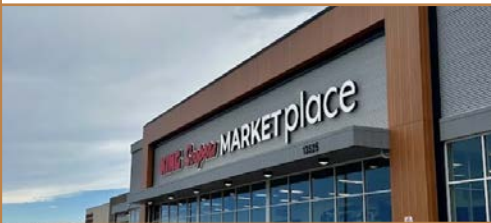
KING SOOPERS MARKETPLACE & AMBER CREEK 332 SFDU'S + 102 TOWNHOMES UNDER CONSTRUCTION