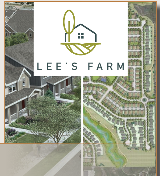
LEE'S FARM 250 SFDU'S