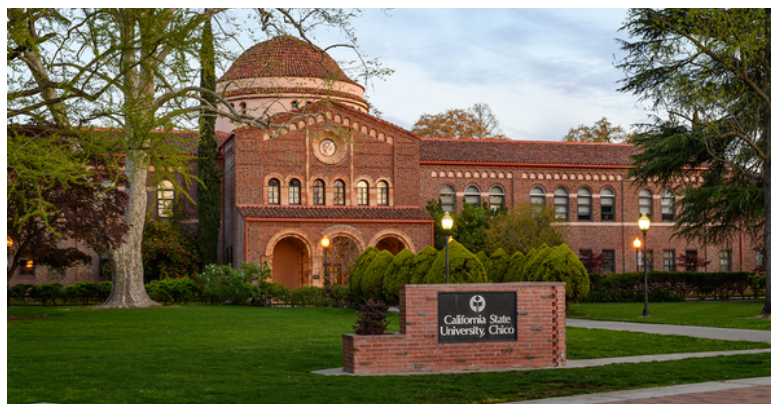
Pictured: CSU Chico, Bidwell Park, Sierra Nevada Brewery