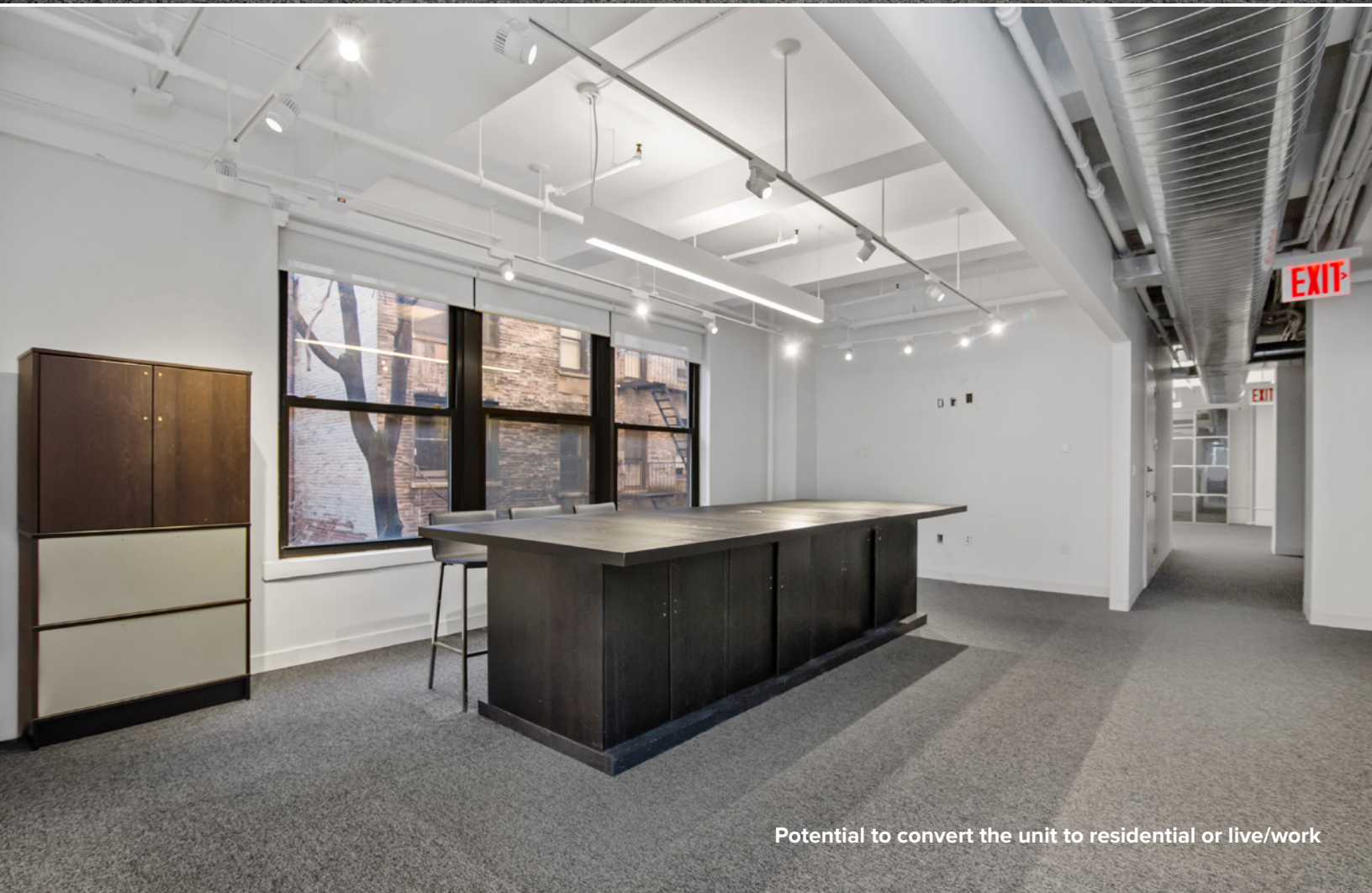
Potential to convert the unit to residential or live/work