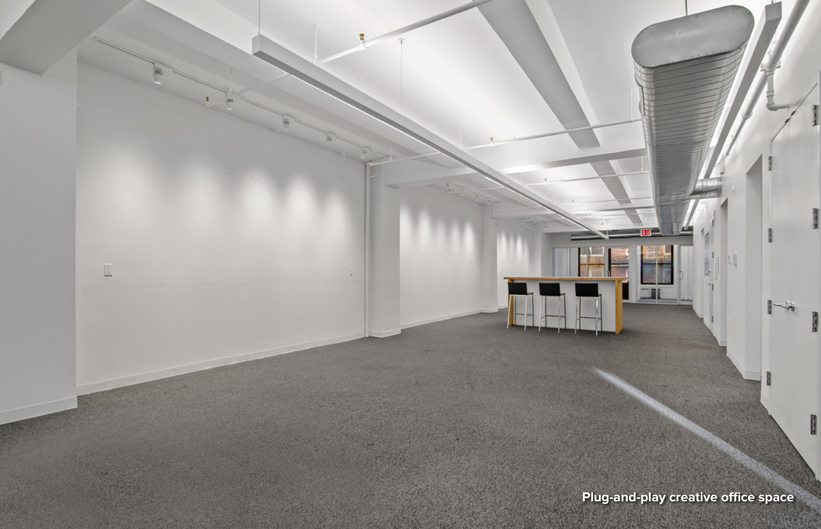
Plug-and-play creative office space