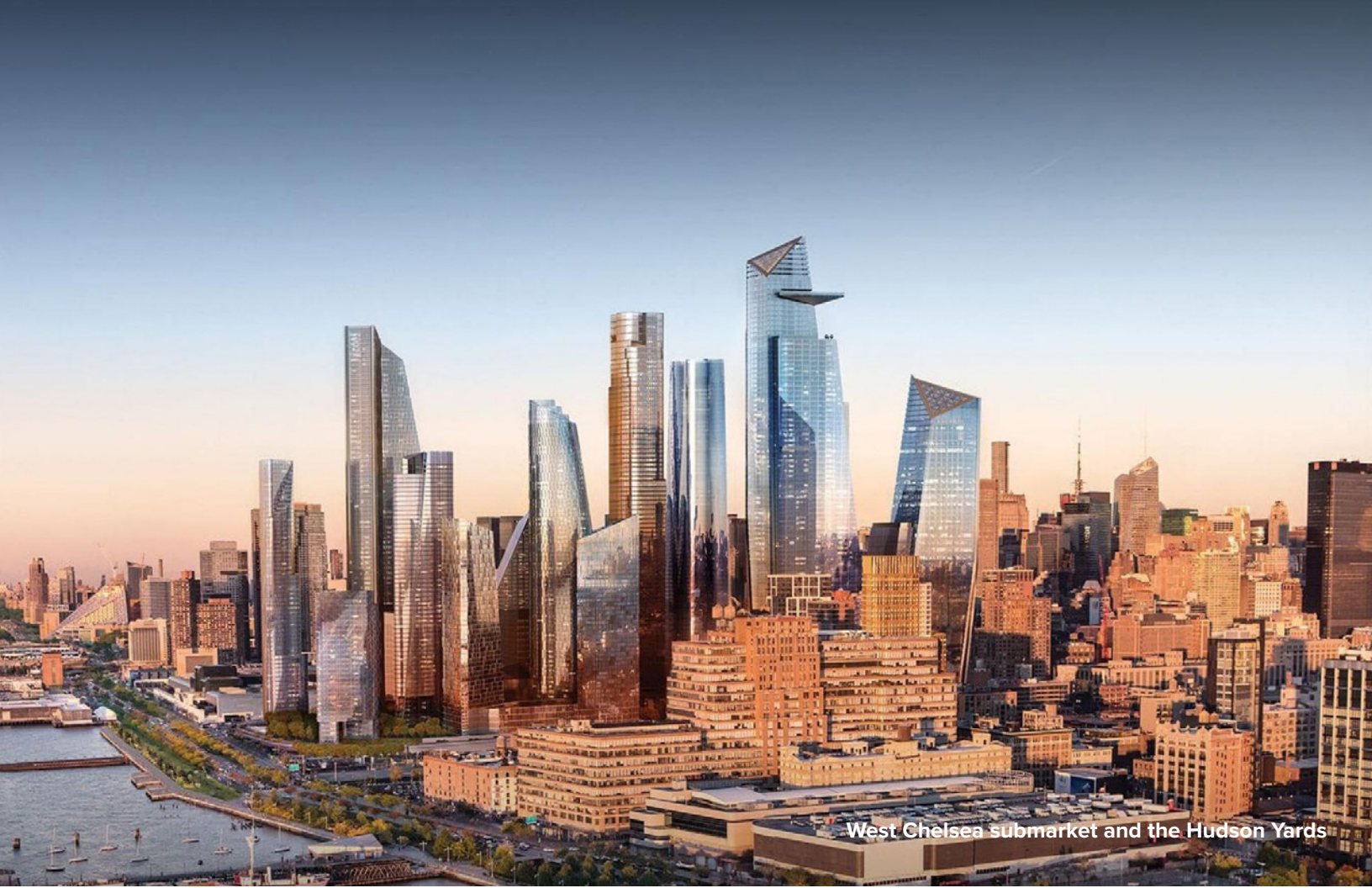
West Chelsea submarket and the Hudson Yards