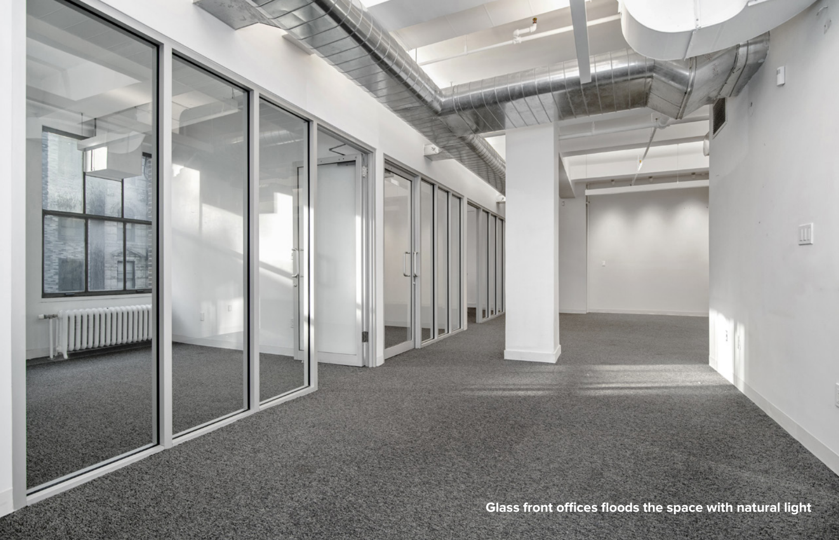
Glass front offices floods the space with natural light