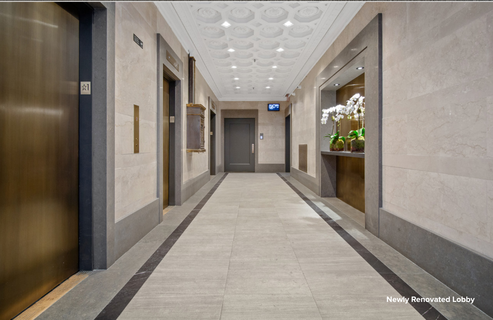
Newly Renovated Lobby