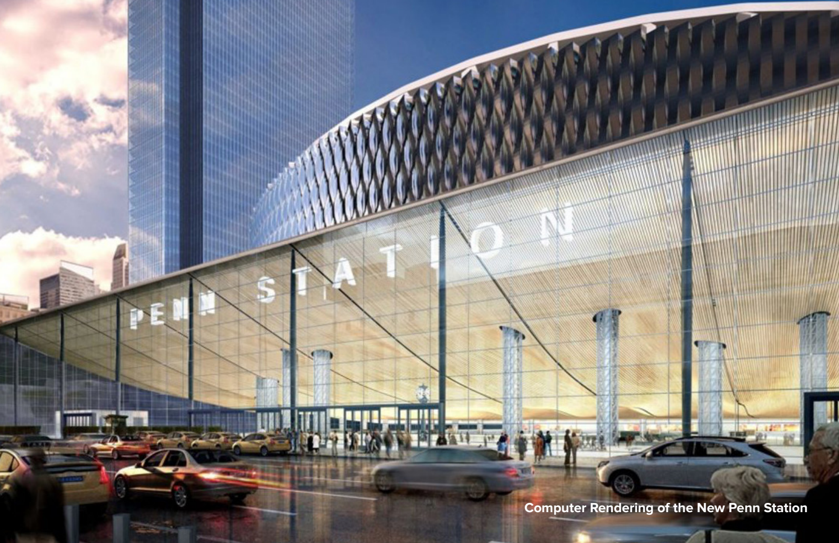
Computer Rendering of the New Penn Station