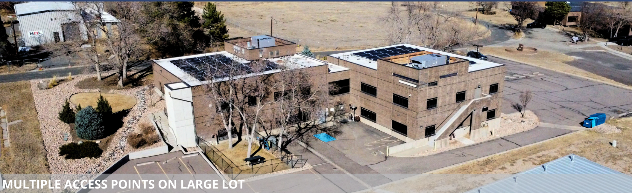
MULTIPLE ACCESS POINTS ON LARGE LOT