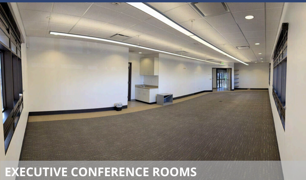
EXECUTIVE CONFERENCE ROOMS