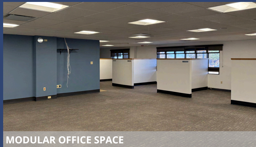
MODULAR OFFICE SPACE