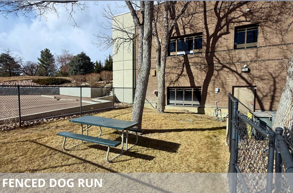
FENCED DOG RUN