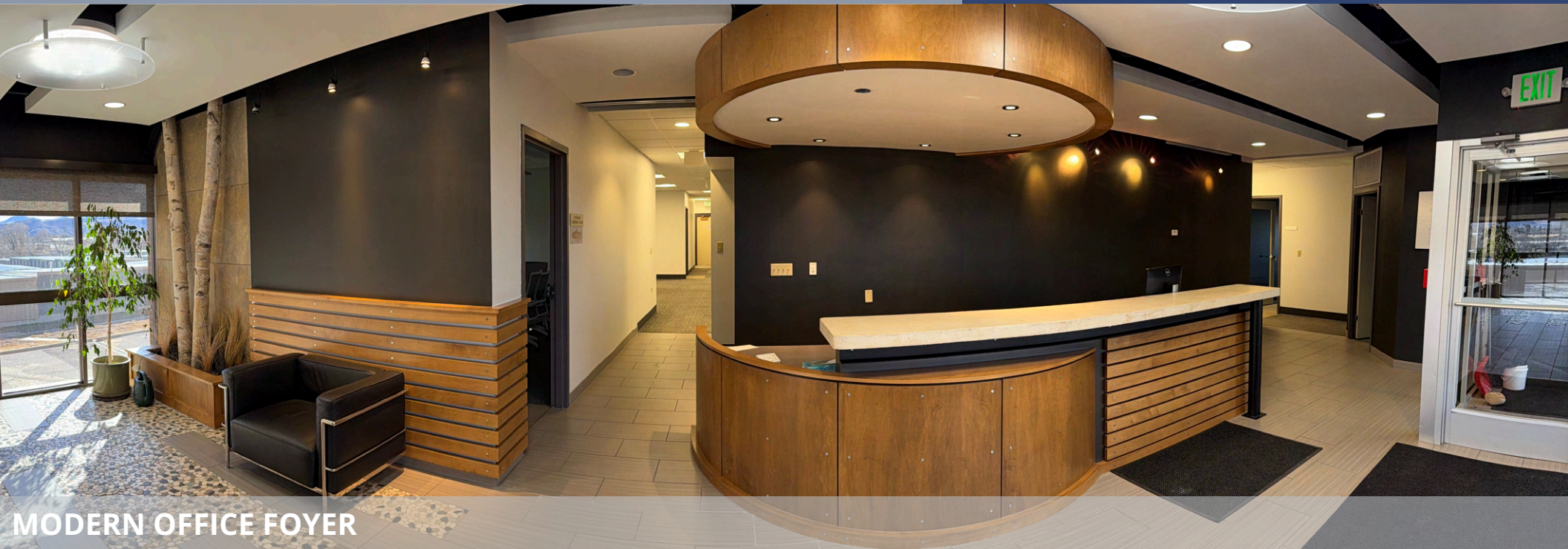
MODERN OFFICE FOYER