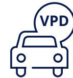
Vehicles Per Day ±81,600 via I-85