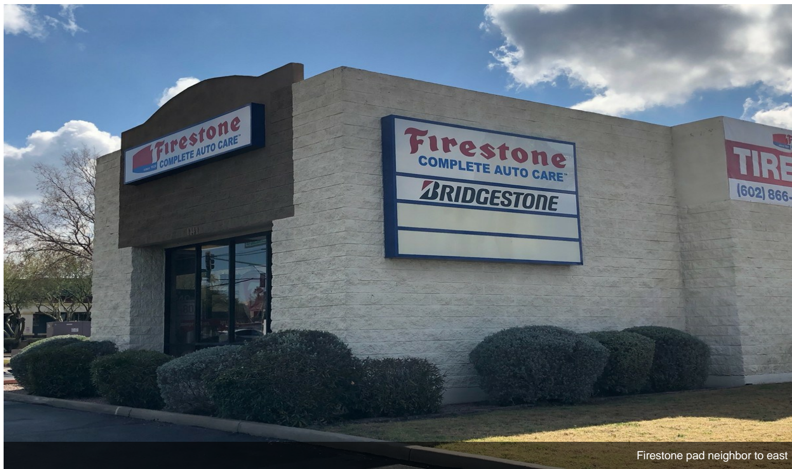
Firestone pad neighbor to east