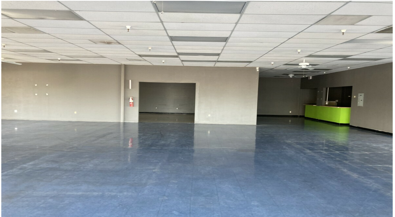
Suites 1-2 Open floor plan