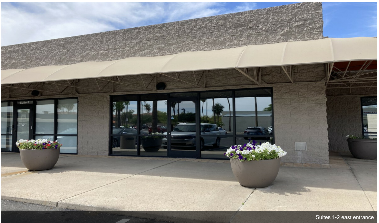
Suites 1-2 east entrance