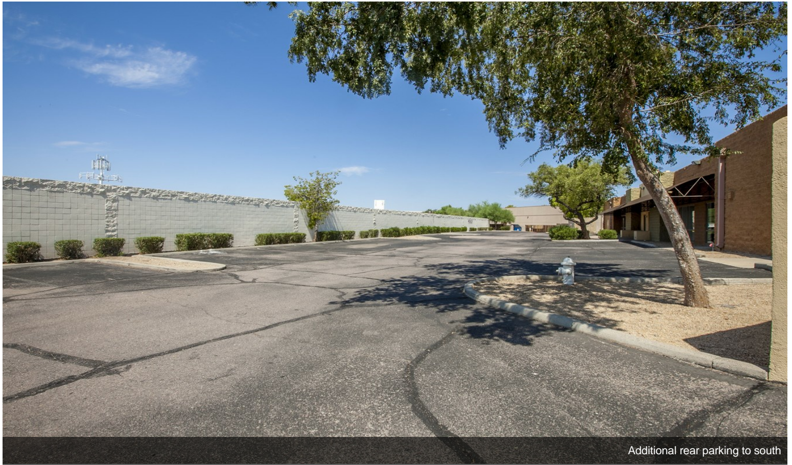
Additional rear parking to south