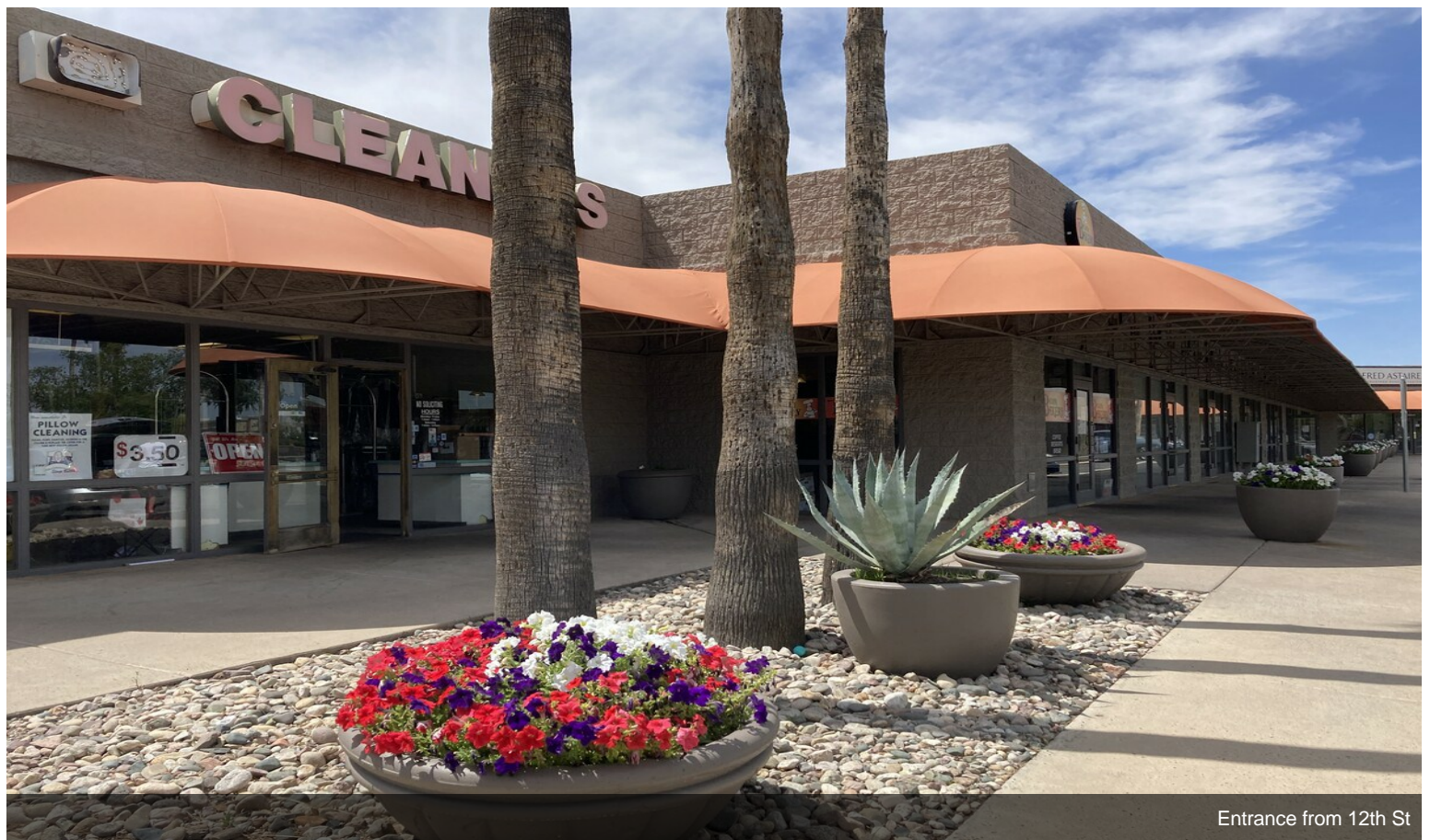
Entrance from 12th St