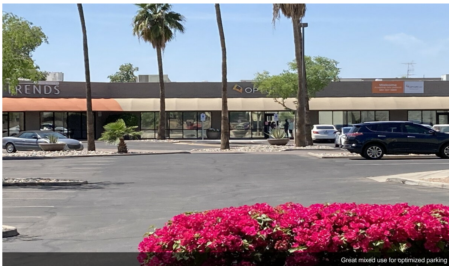
Great mixed use for optimized parking