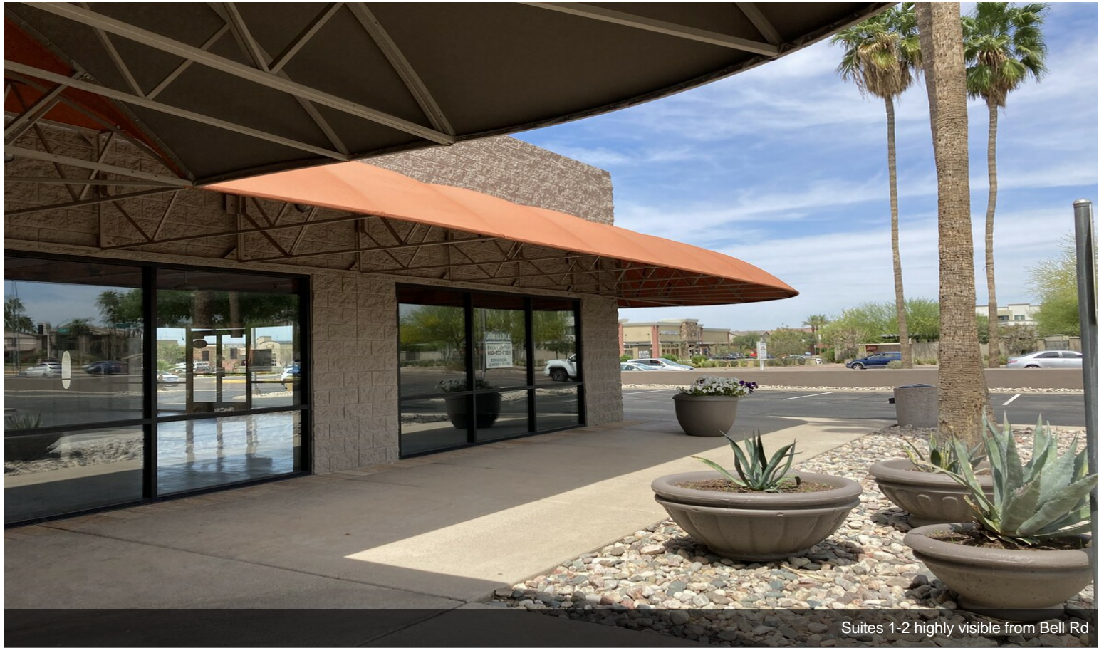
Suites 1-2 highly visible from Bell Rd