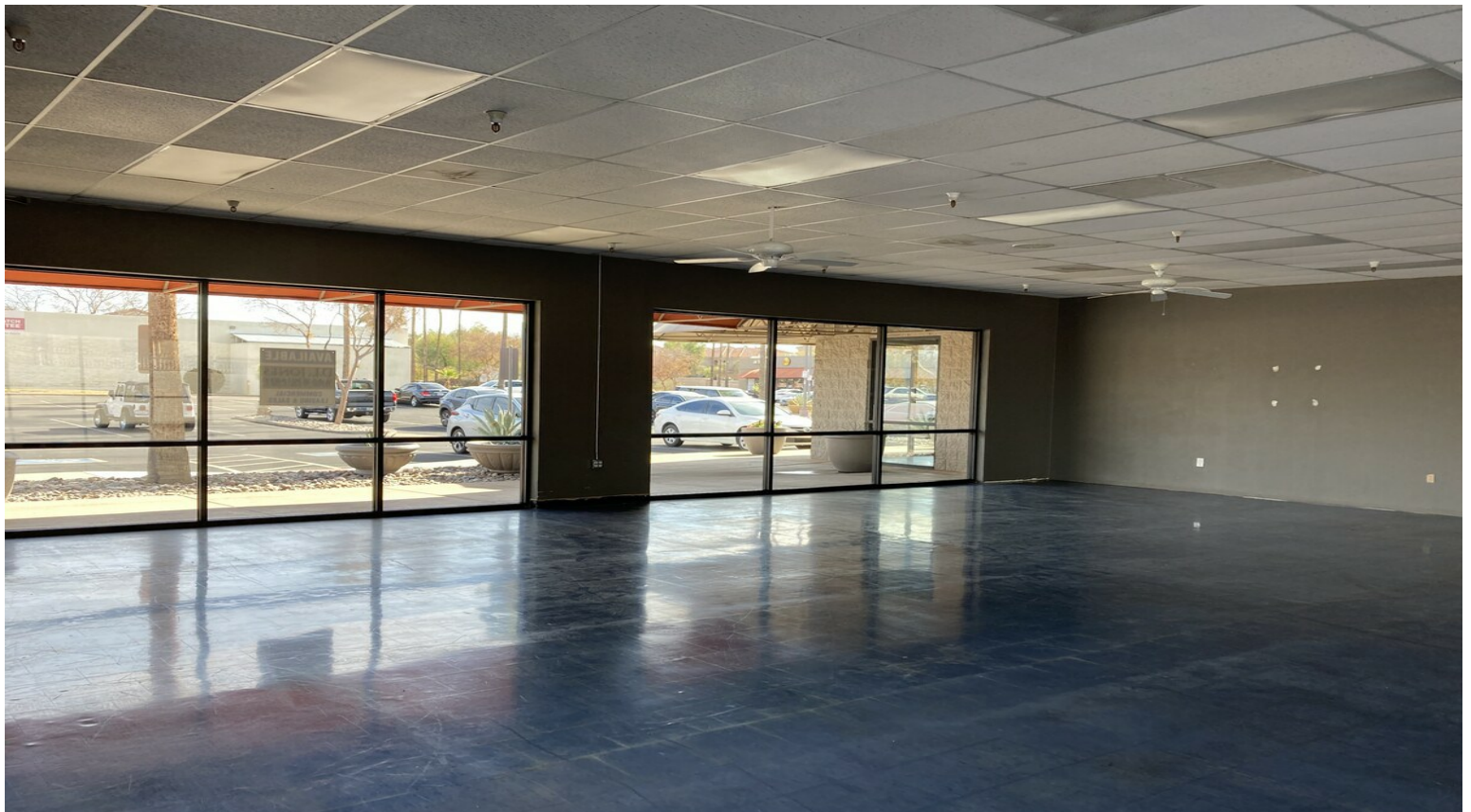
Light and Bright