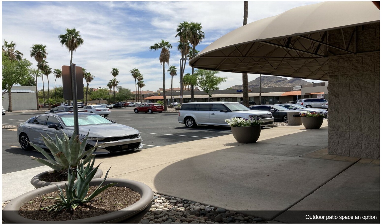
Outdoor patio space an option