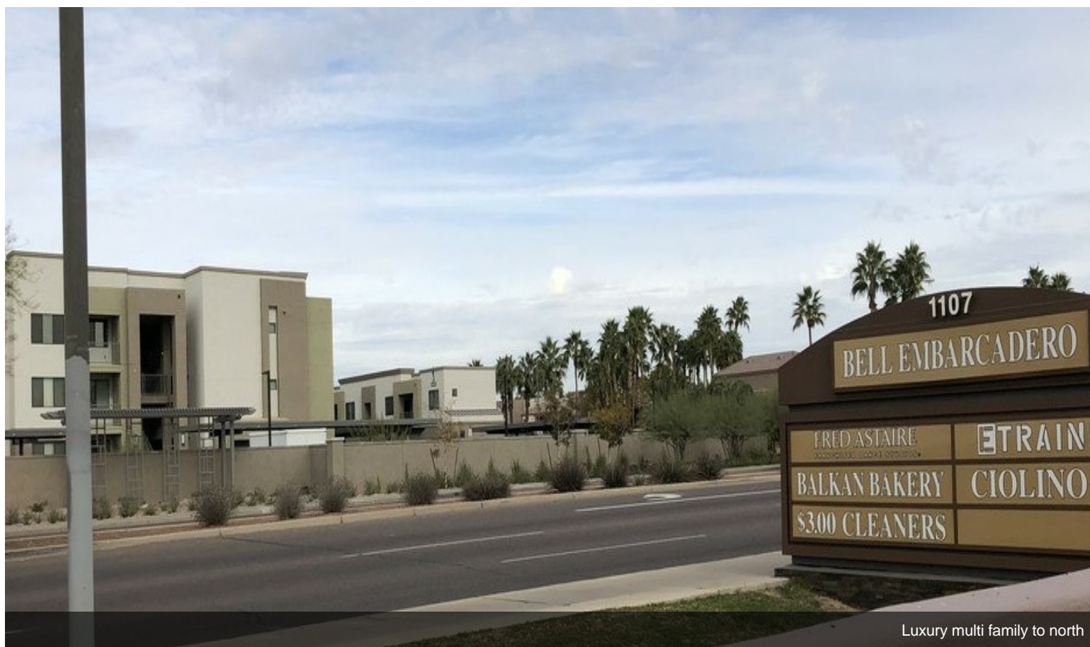
Luxury multi family to north