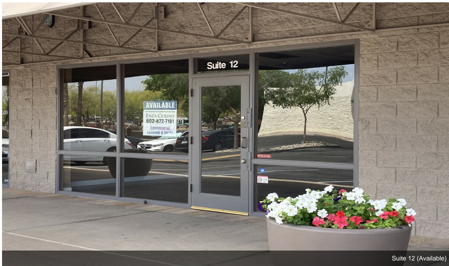
Suite 12 (Available)