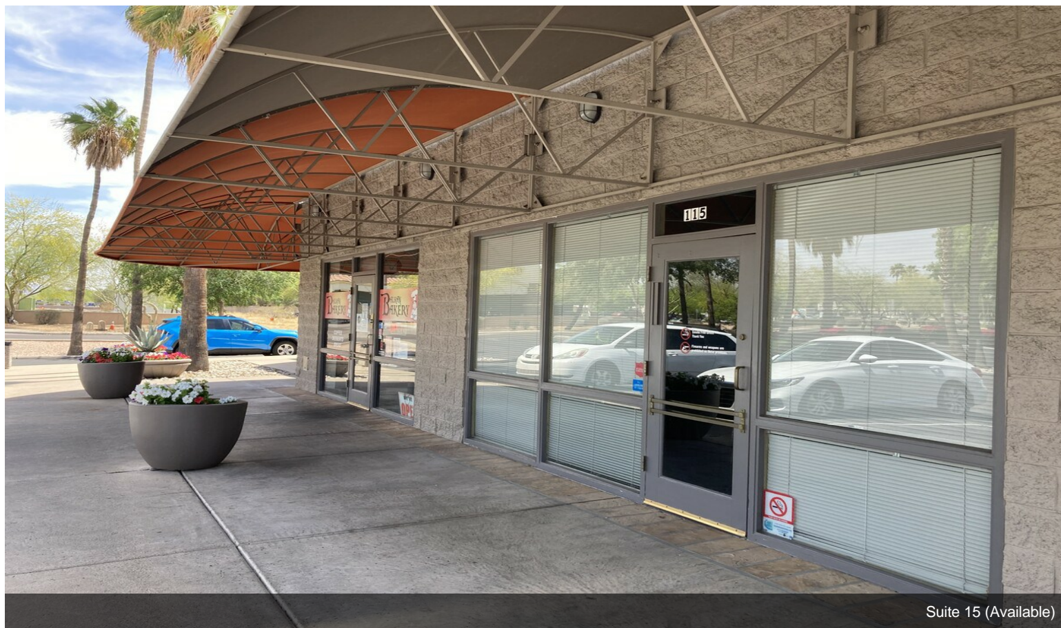
Suite 15 (Available)