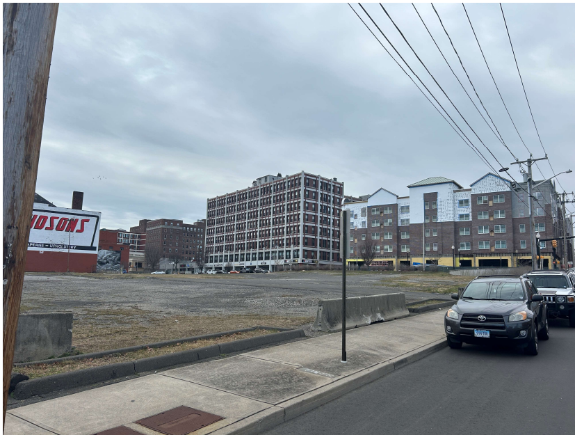
Redevelopment Site Across the Street