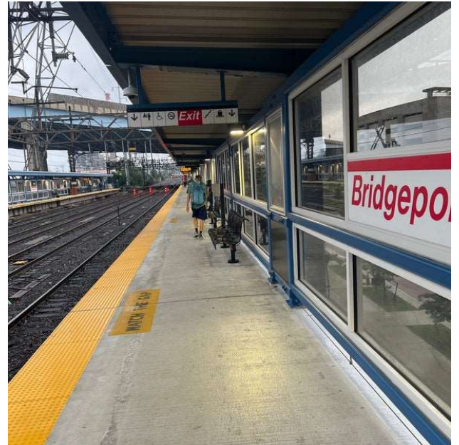
Walk to Bridgeport's Metro North & Amtrack Stations