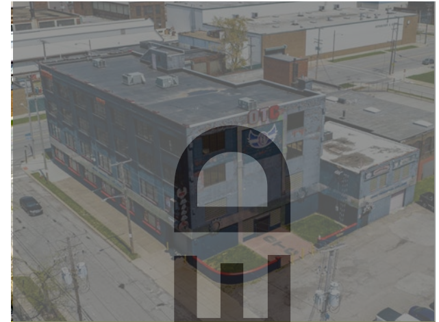
5100 St. Clair Avenue