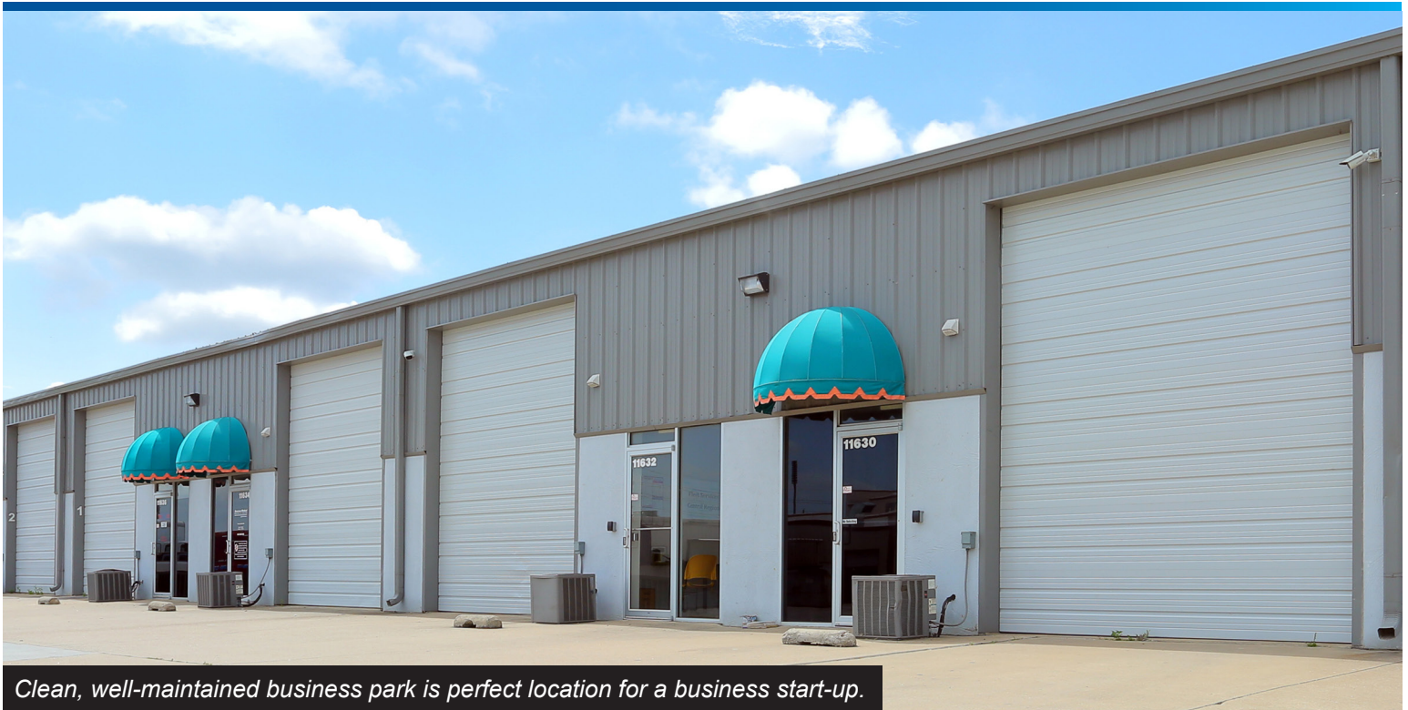
Clean, well-maintained business park is perfect location for a business start-up.