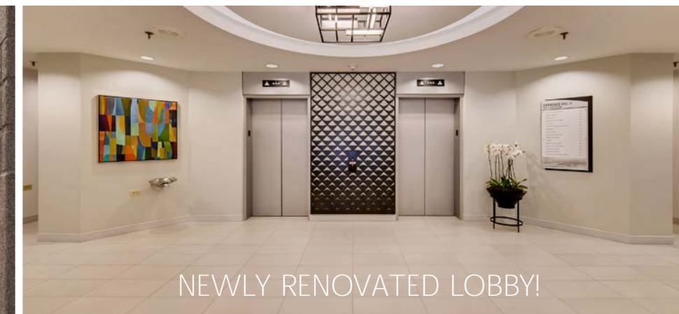
NEWLY RENOVATED LOBBY!