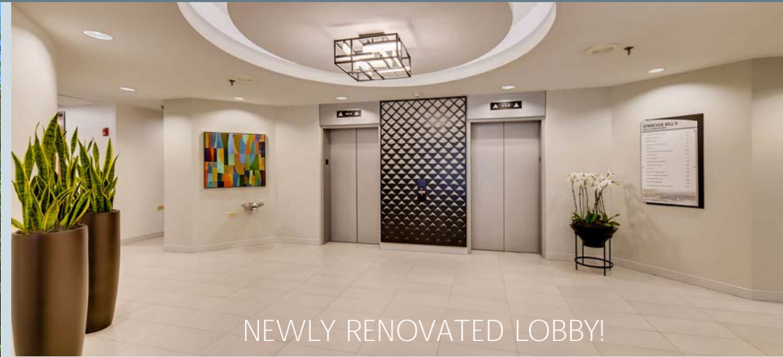
NEWLY RENOVATED LOBBY!