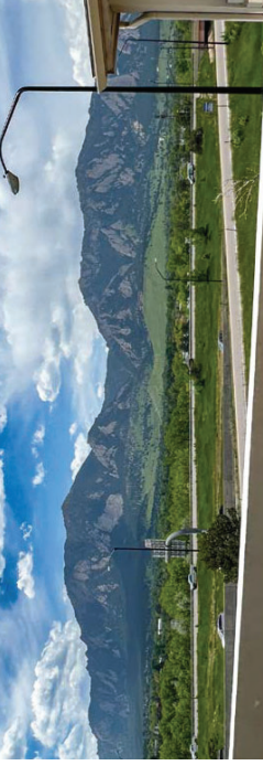
All Tenant Access Patio

Suites are available. Suites are leased at triple net rates starting at $14.50/sq. ft. and Individual Offices are offered at gross rates including all expenses with access to shared waiting areas, full kitchen, and patio areas. Please inquire about suites.