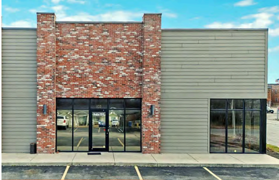
END CAP SPACE