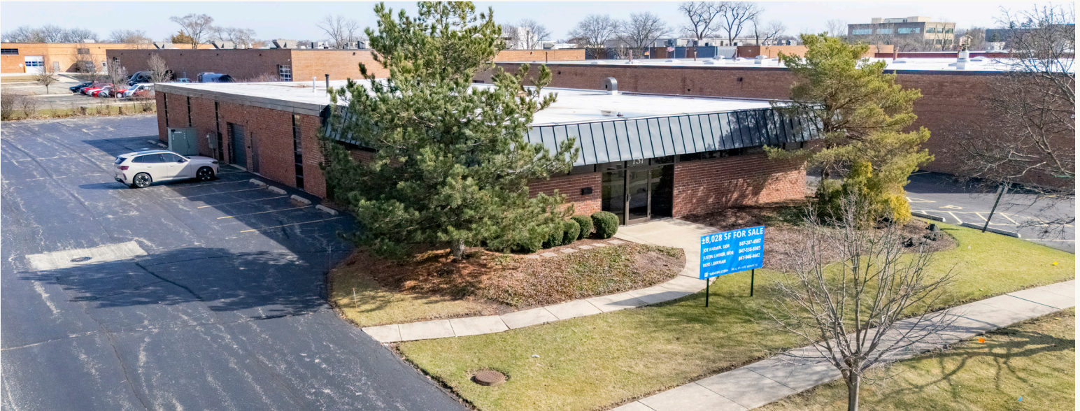
PROPERTY AERIAL - FACADE, DRIVEWAY, AND PARKING