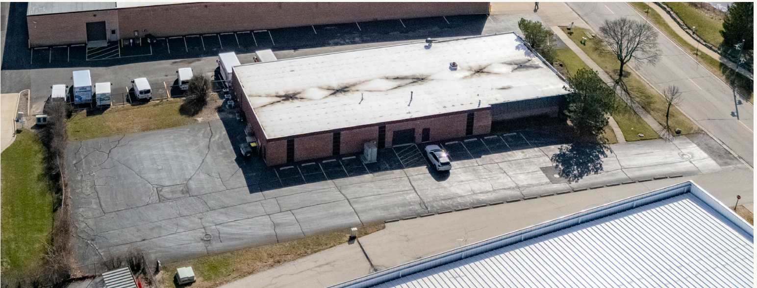
PROPERTY AERIAL - ADDITIONAL PARKING OR OUTDOOR STORAGE