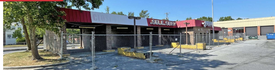
4209 Bladensburg - former car wash