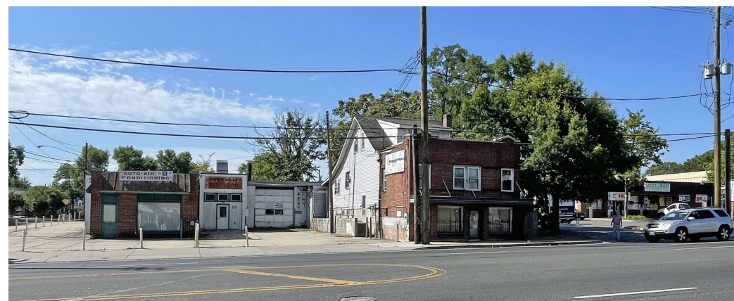
4237 Bladensburg - former garage/storefront