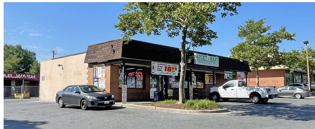
4201 Bladensburg - current convenience store