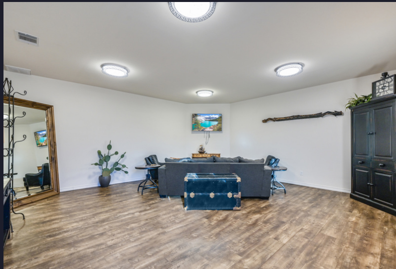
Groom - Prep Room