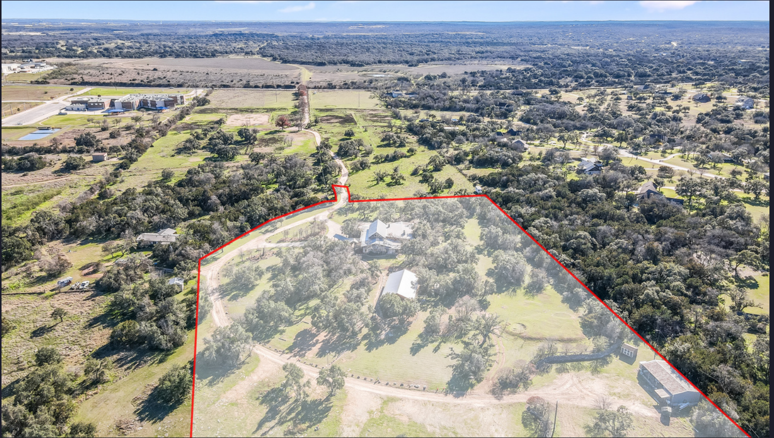
Boundary Line Photo

The Lodge - Wedding/Event Venue - 7.71 Acres - Buda