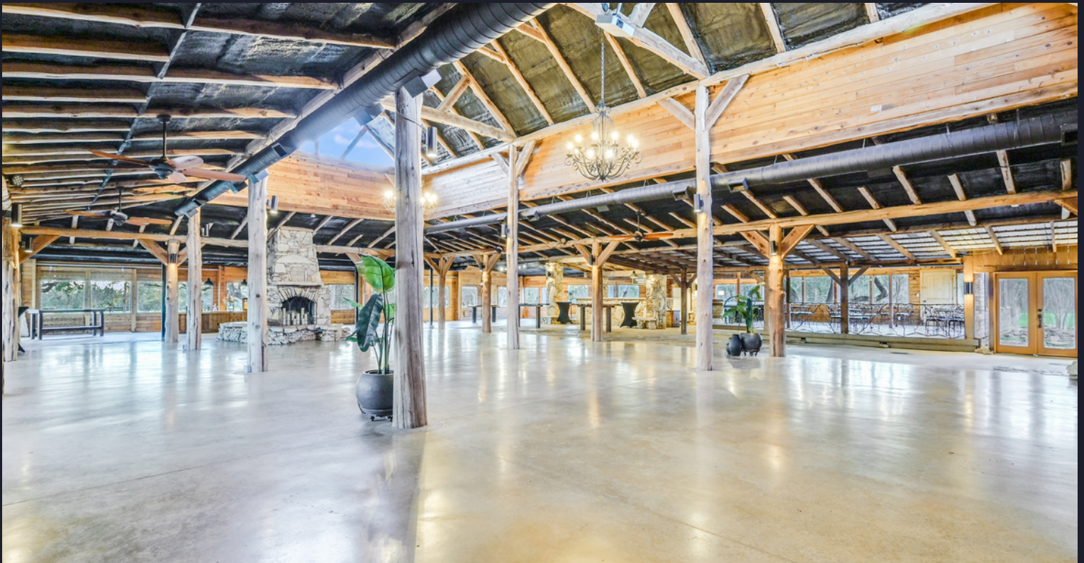
Interior Photo - Texas Rustic & Open Plan