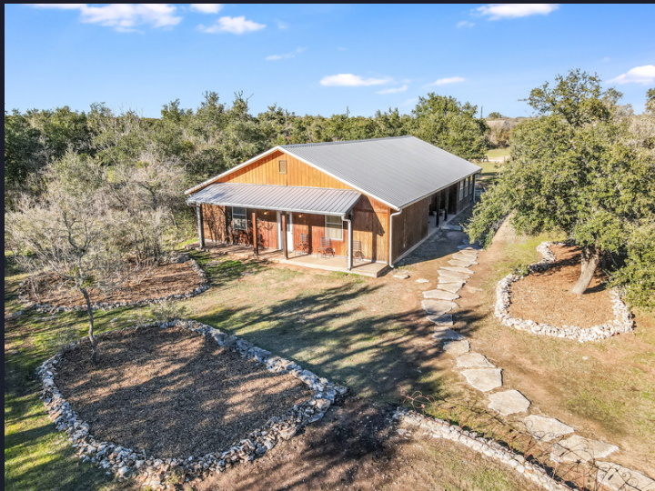
Multipurpose Building Aerial