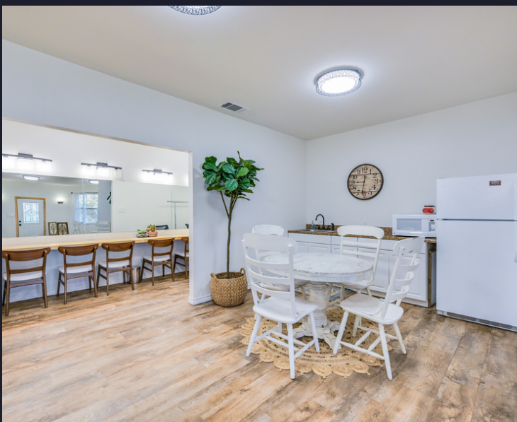
Bride Prep & Kitchen Area