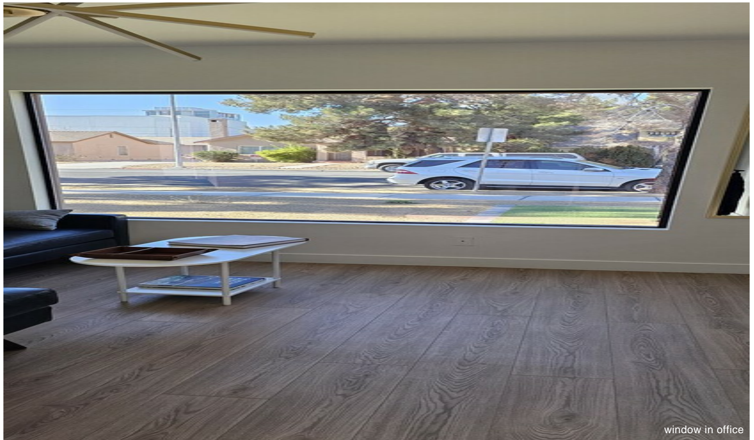
window in office