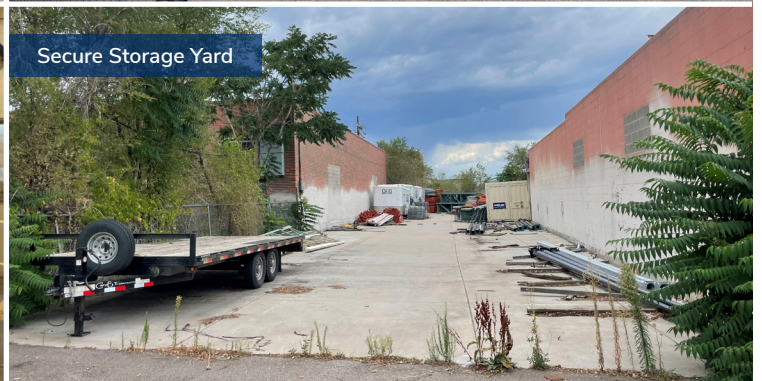
Secure Storage Yard