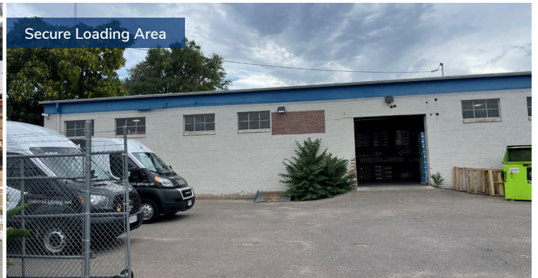
Secure Loading Area