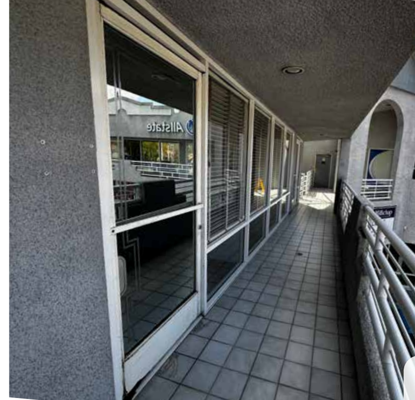
SUITE 202 800 SF