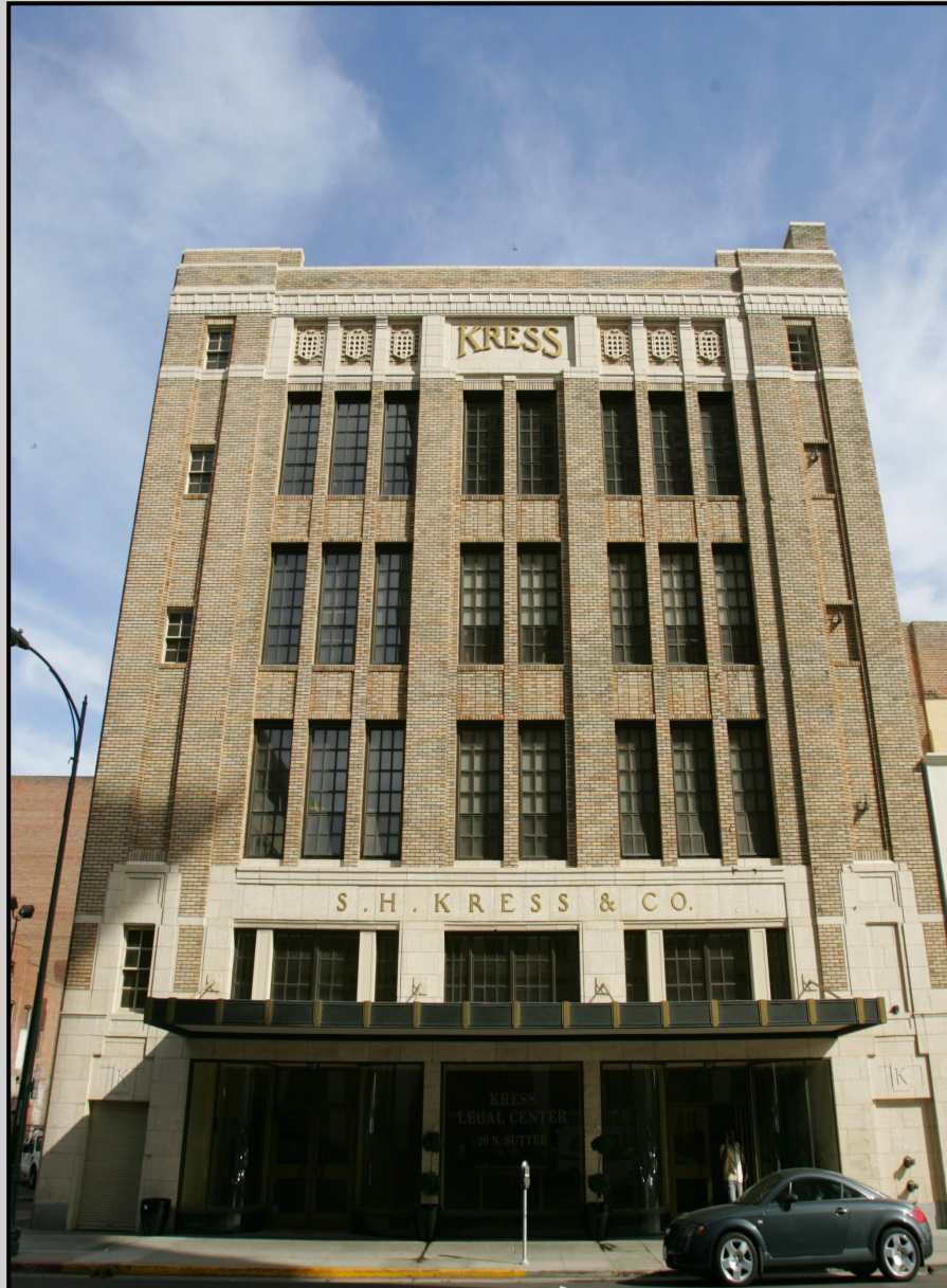
Sutter Street entrance