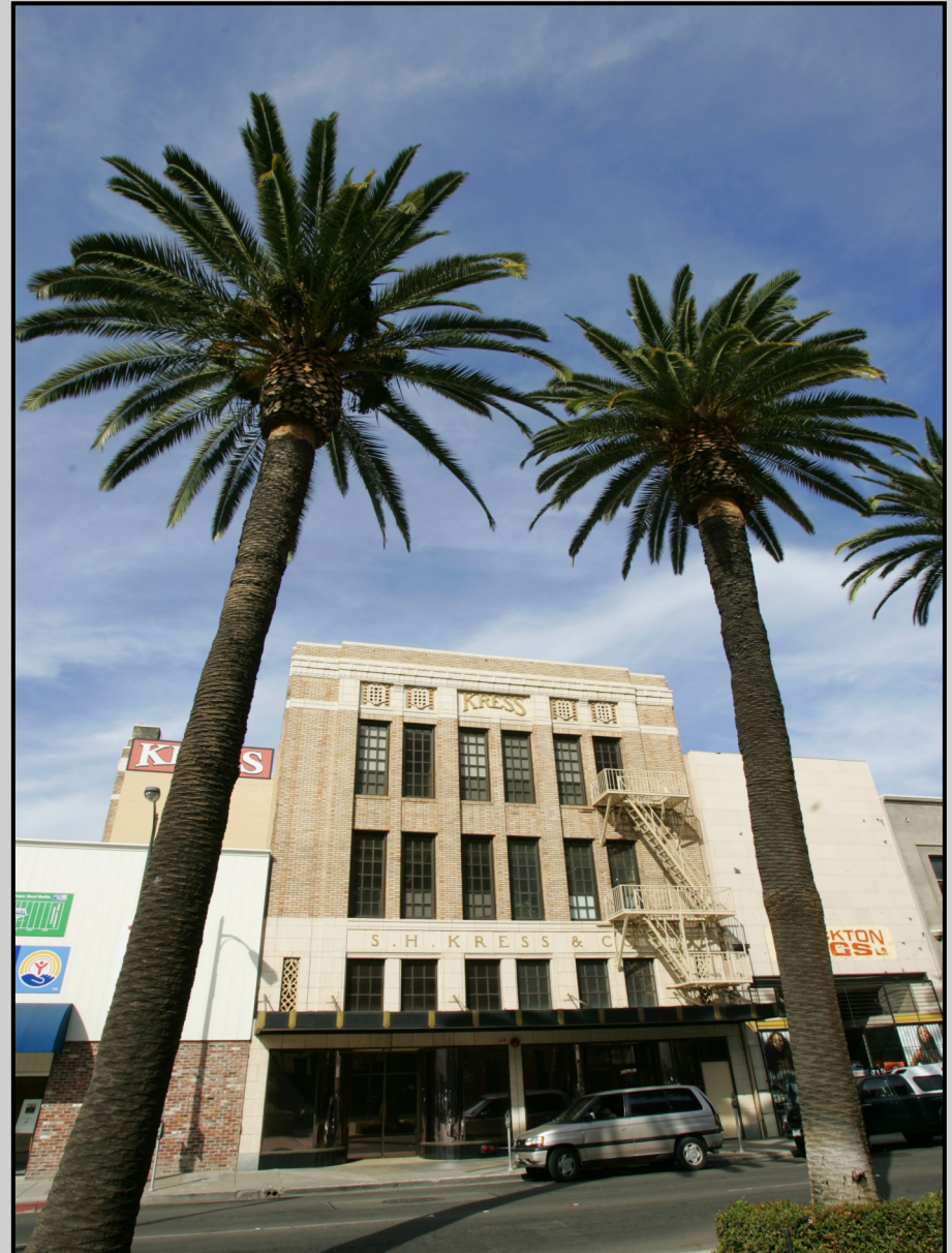
Main Street entrance