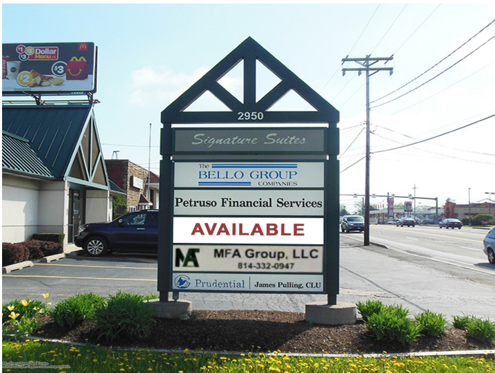
Excellent Signage & Visibility