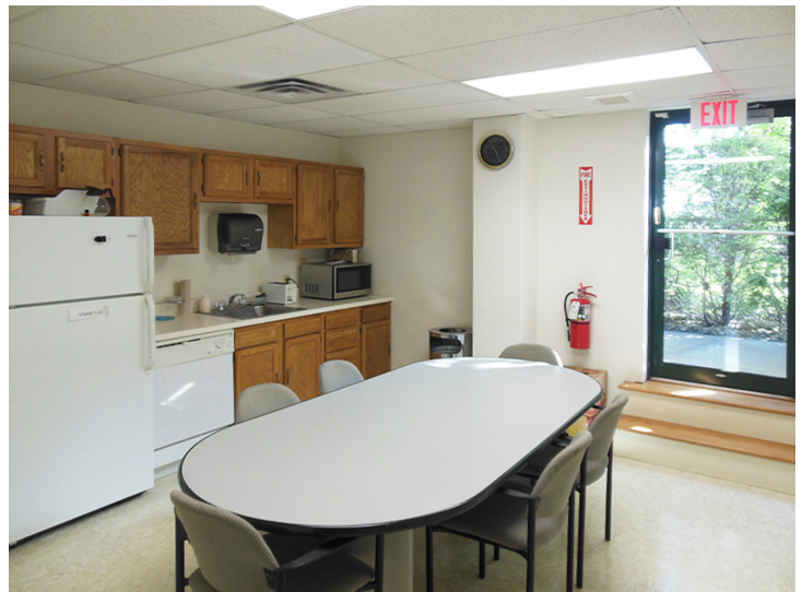
Shared Break Room With Patio