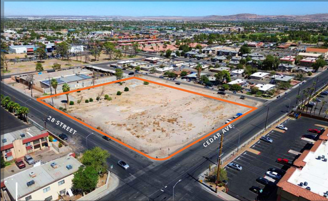
View looking Northeast