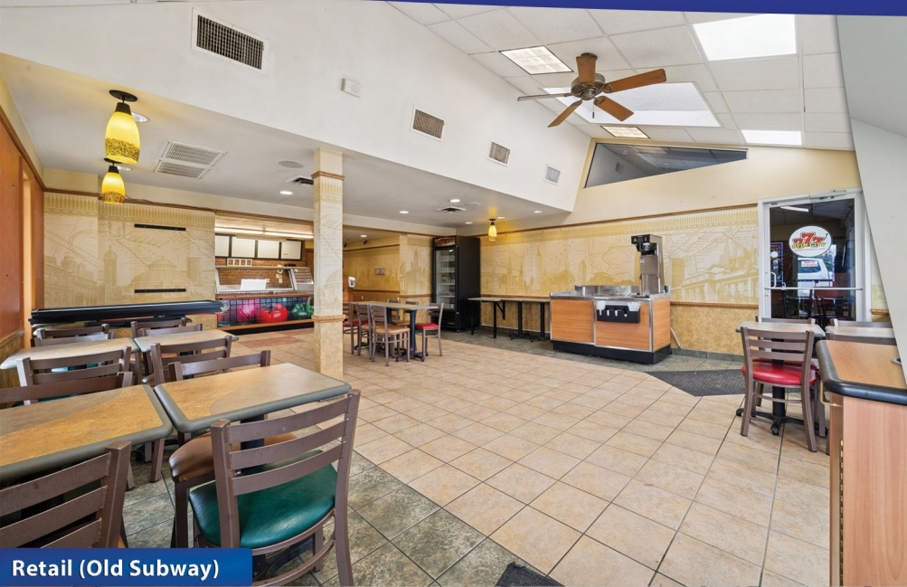
Retail (Old Subway)