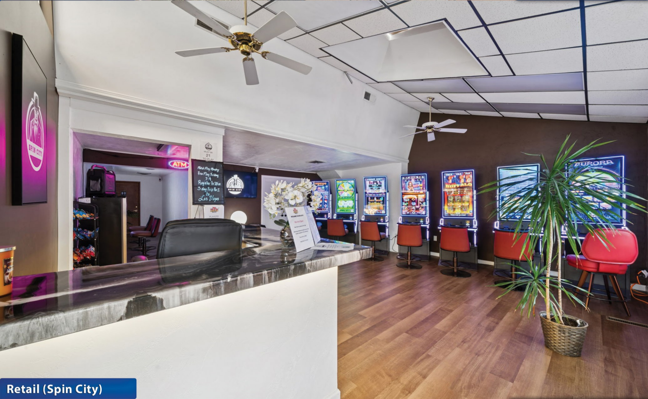
Retail (Spin City)