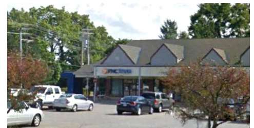
Western Hills 6105 Cleves Warsaw Pike