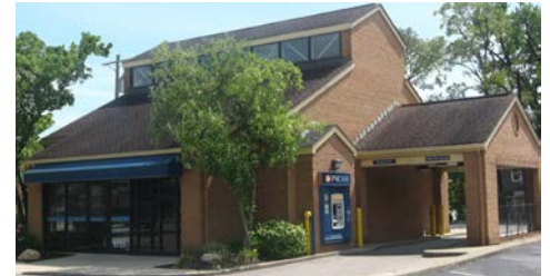
Madisonville 5727 Madison Road