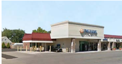
Deer Park 3912 E. Galbraith Road