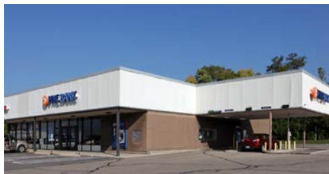
Sharonville 12075 Lebanon Road