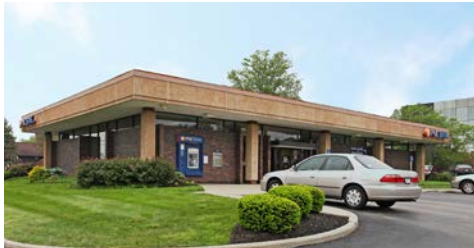
Anderson Township 7391 Beechmont Avenue