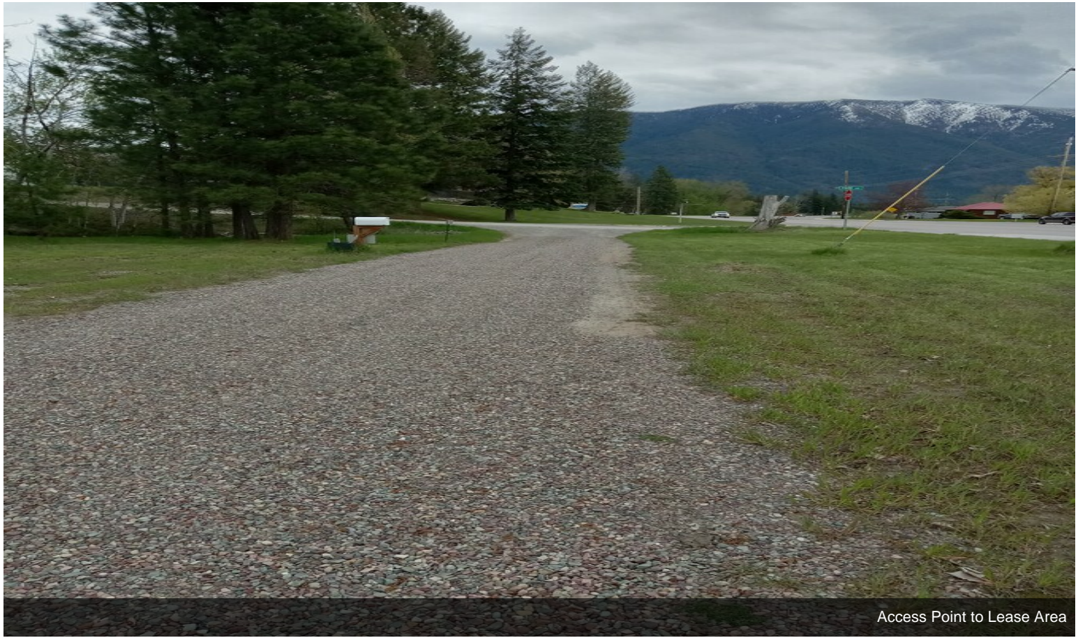
Access Point to Lease Area