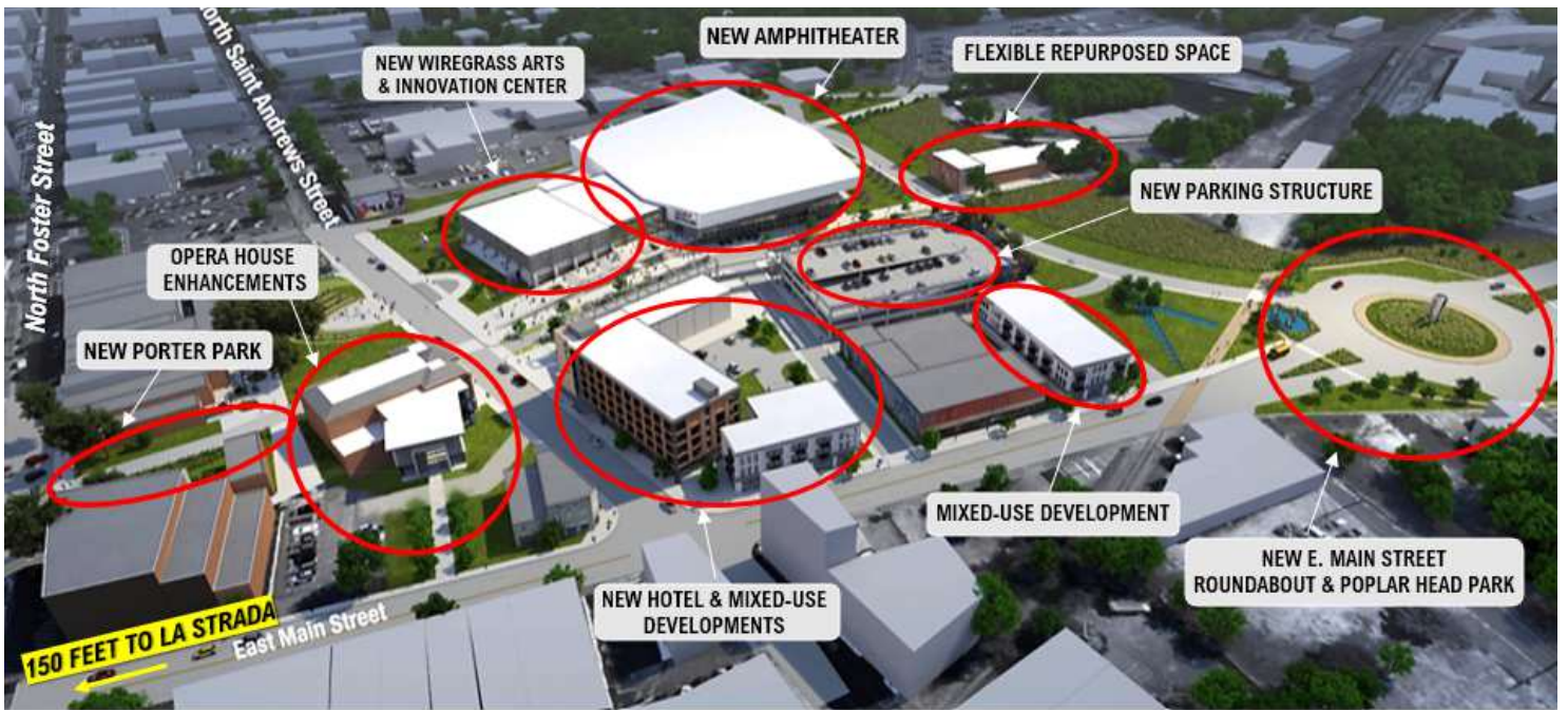
New City Center Developments In Progress ---- La Strada 150 feet from new Porter Park gateway on Foster Street