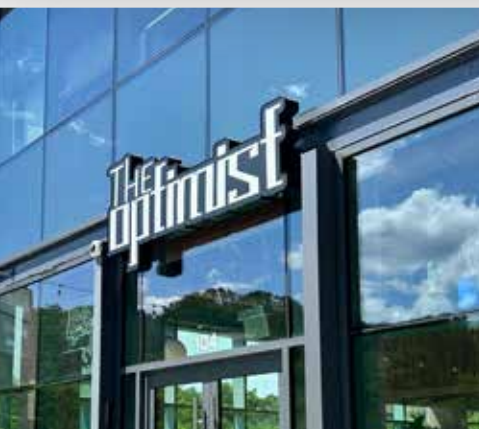
On-Site Dining Amenities at Crabtree Terrace

boasts a range of on-site amenities catering to all hours, including The Optimist for morning pick-me-ups, Perry's Steakhouse for a fine dining experience, and Meet Fresh for a refreshing boba tea fix.