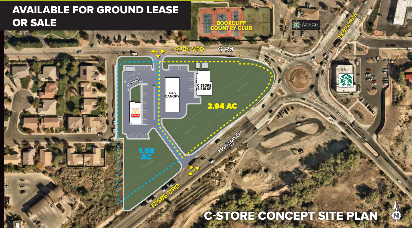
C-STORE CONCEPT SITE PLAN