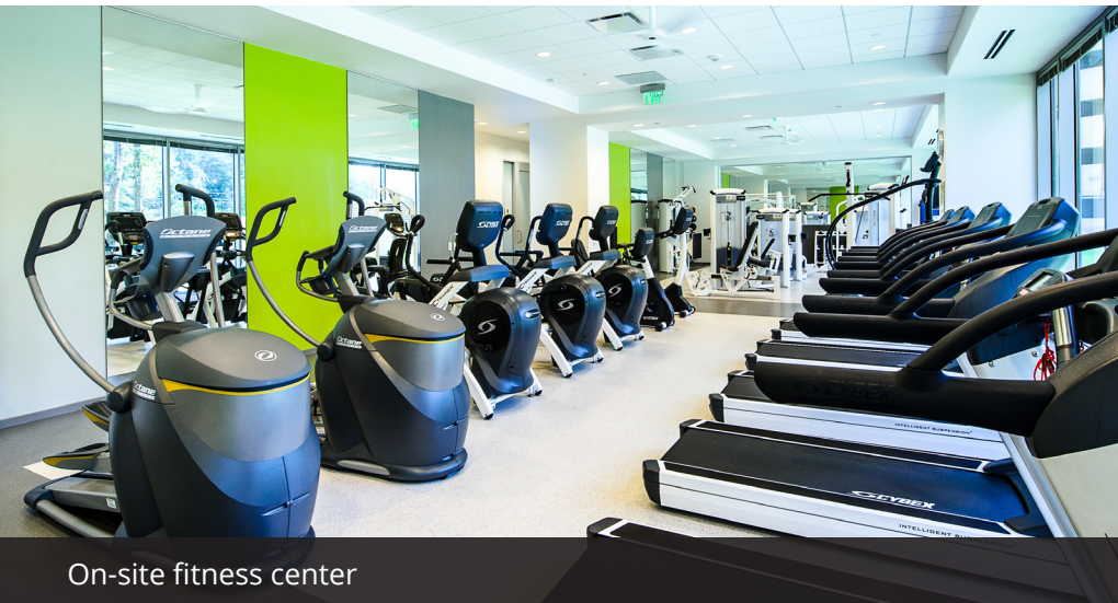
On-site fitness center