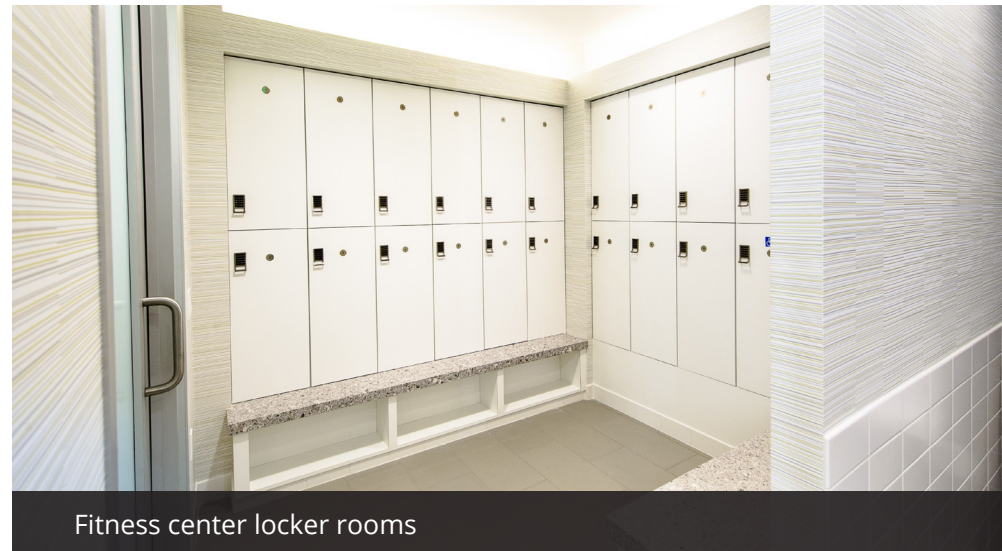
Fitness center locker rooms