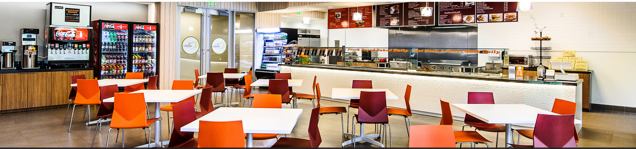
Amenities located within Woodbranch III adjacent to buildings I & II